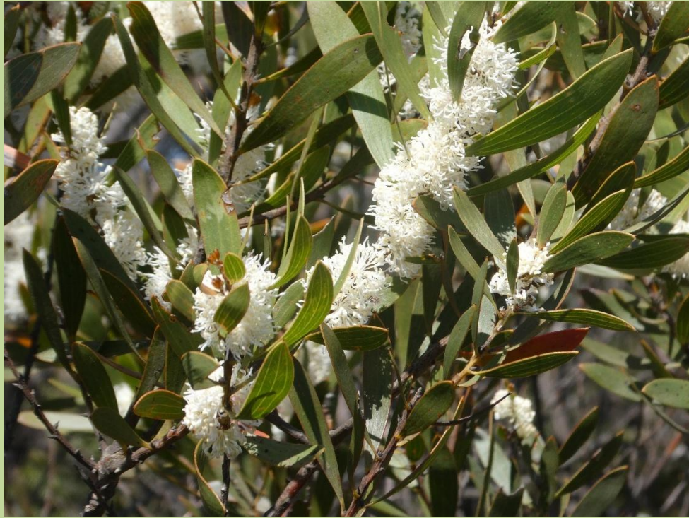
Another plant that looks much more like Hakea dactyloides