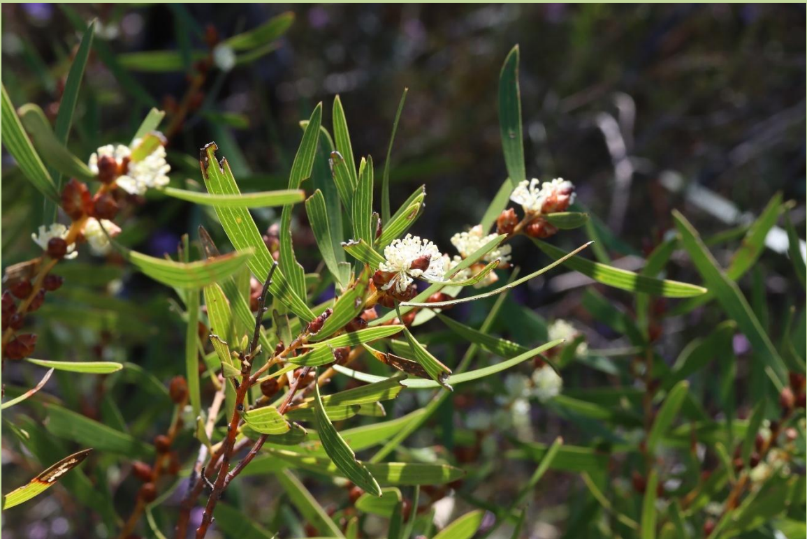
Hakea (probably salicifolia but maybe dactyloides )