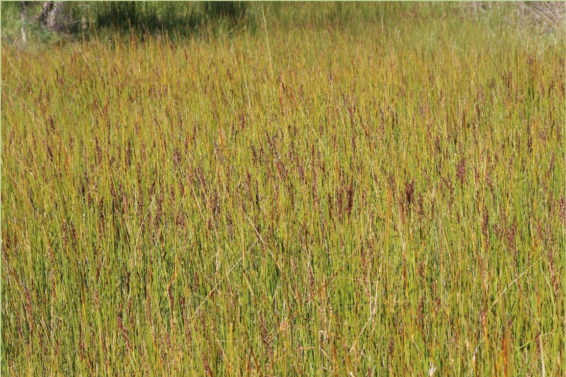
An abstract painting