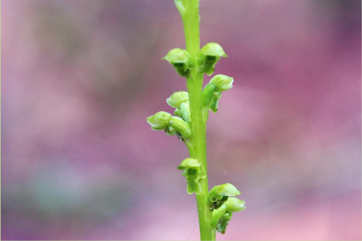
Microtis sp (possibly parviflora looking at the wavy margins)