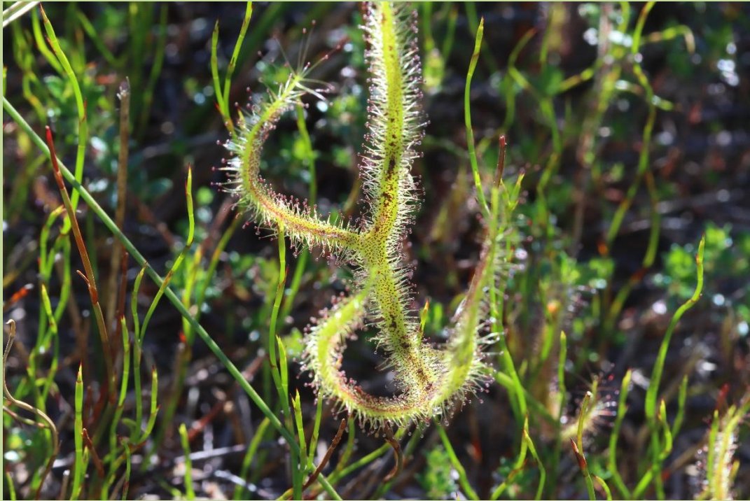
Drosera binata - Forked Sundew 1