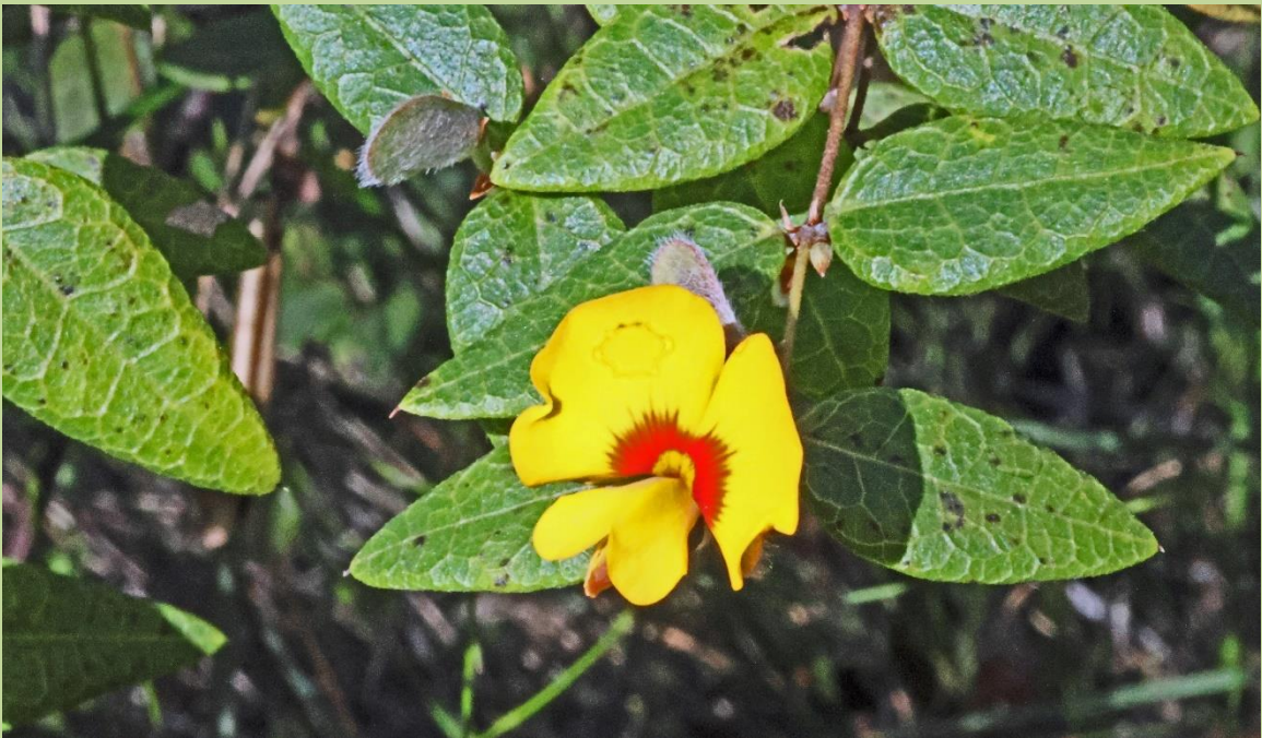
Platylobium formosum subsp formosum