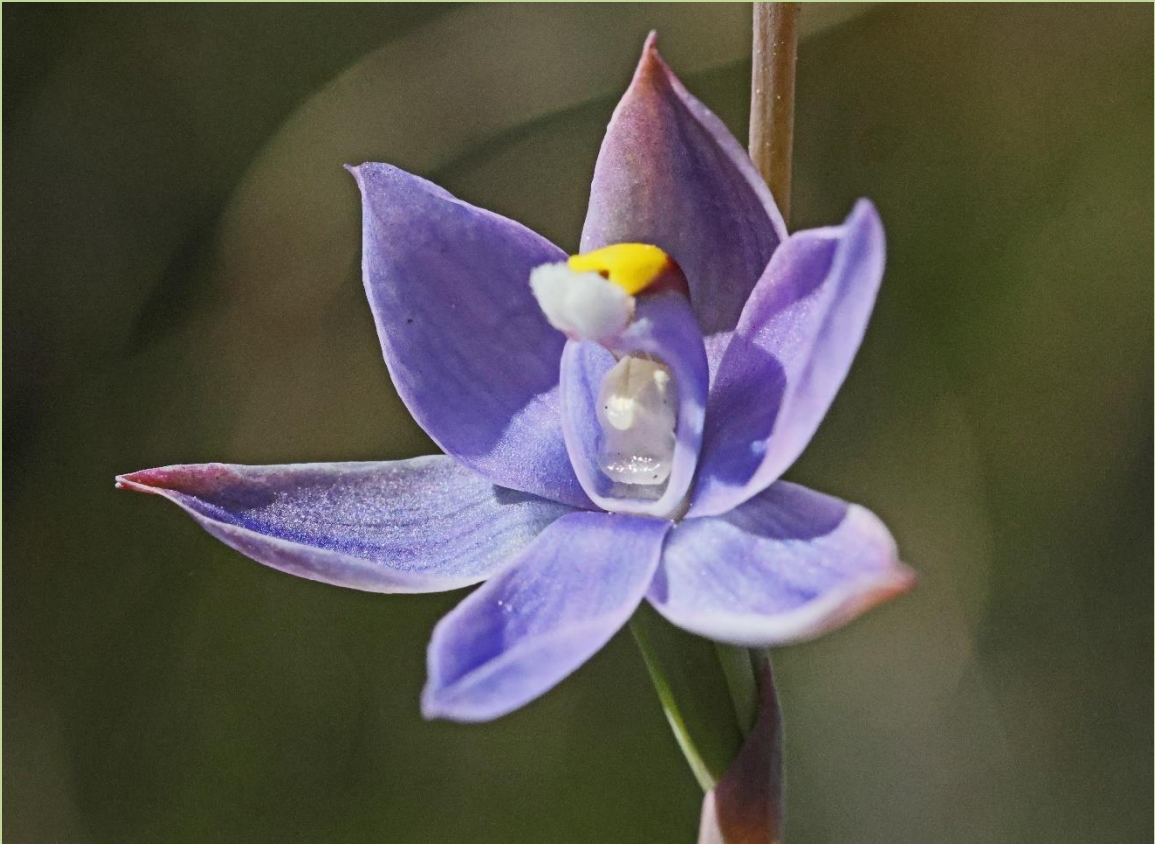
Thelymitra malvina or pauciflora