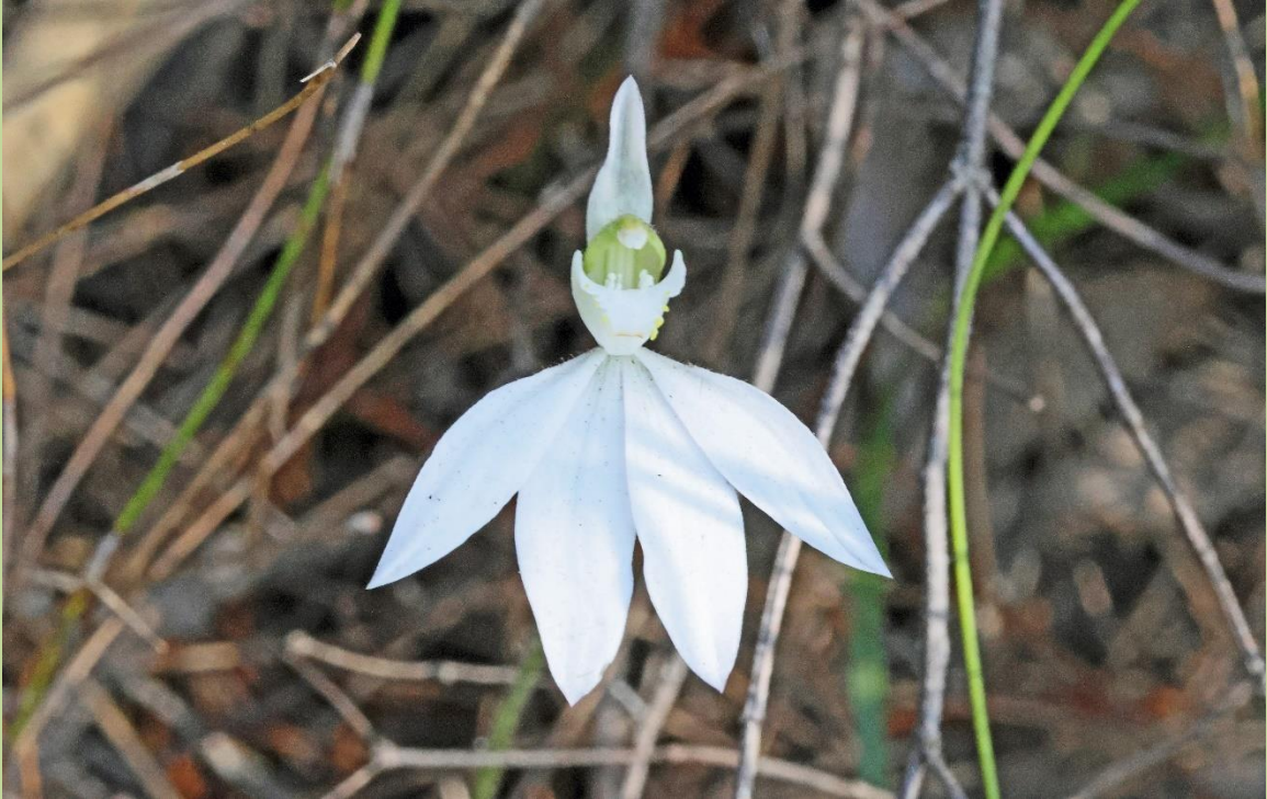
Our old friend, Caladenia catenata