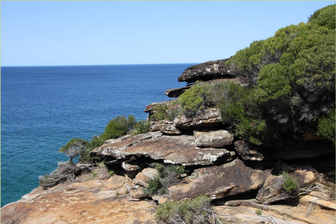
The view over the final drop for Curra Brook