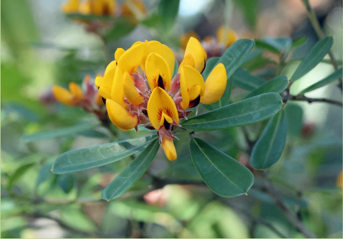
Pultenaea daphnoides (Large-leaf Bush-pea)