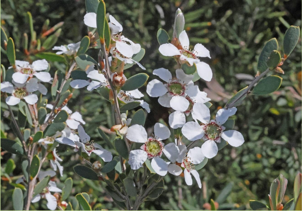
The Coast Track was awash in white: Pimelea and Leptospermum everywhere