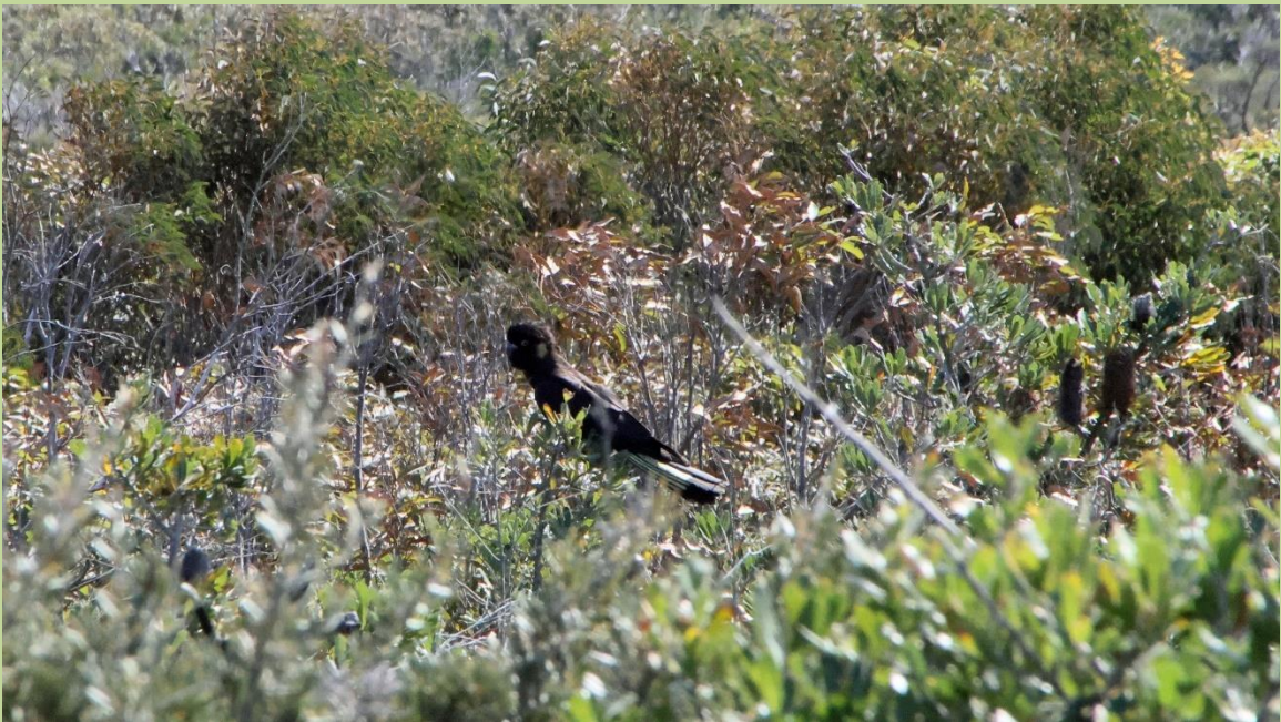
And the odd birds