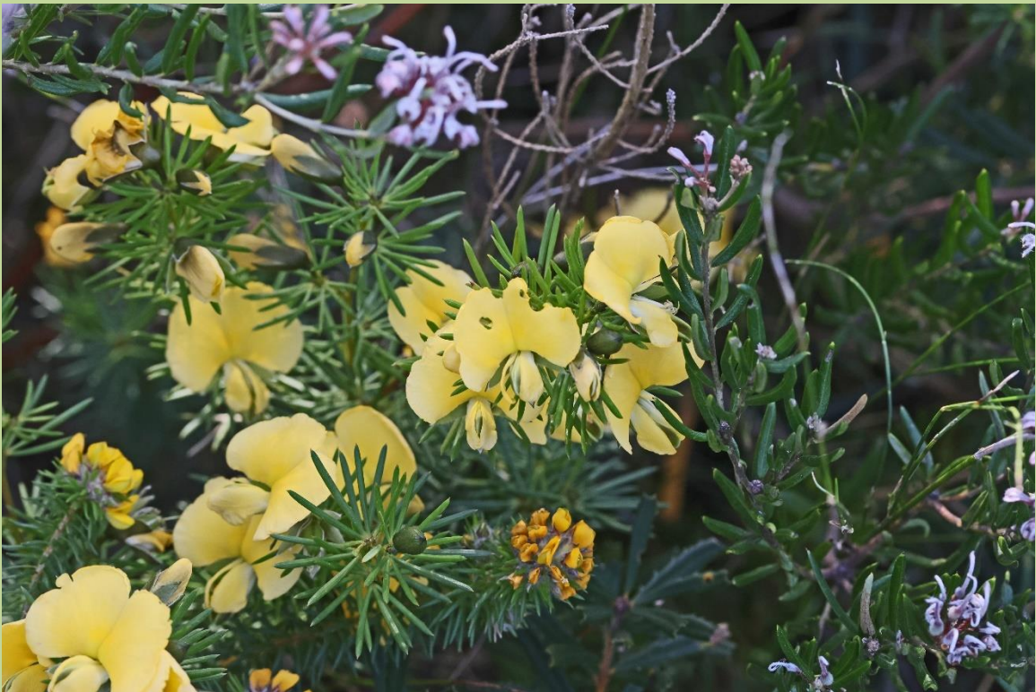
Apparently, Gompholobium flowers are tasty