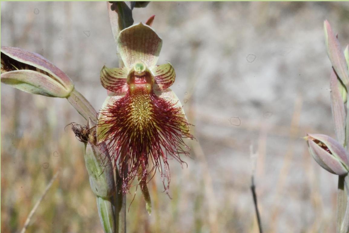
Calochilus paludosus – Red Beard Orchid