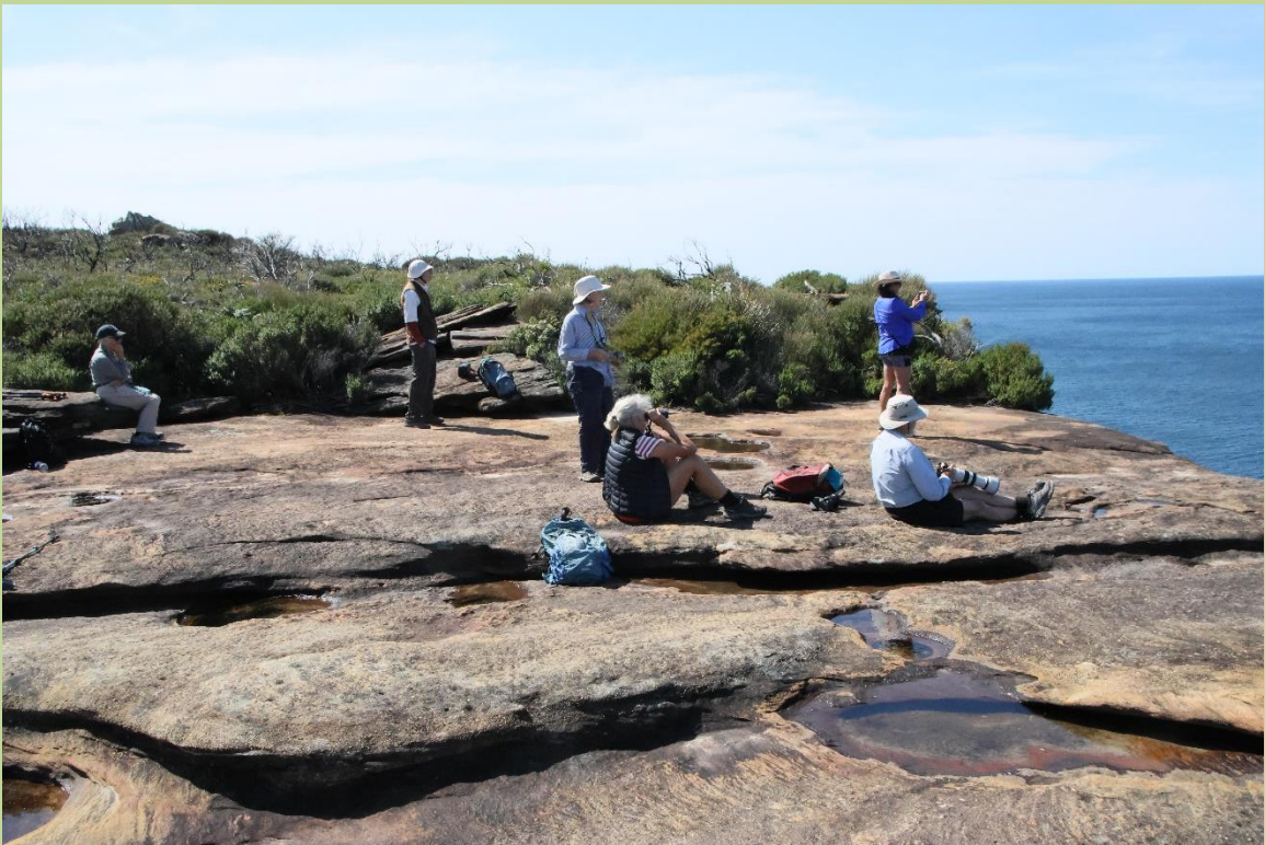
All eyes on the whale!