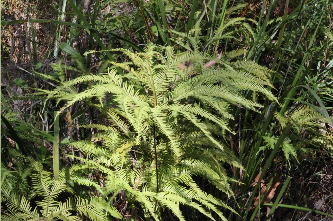
Sticherus flabellatus (Umbrella Fern)