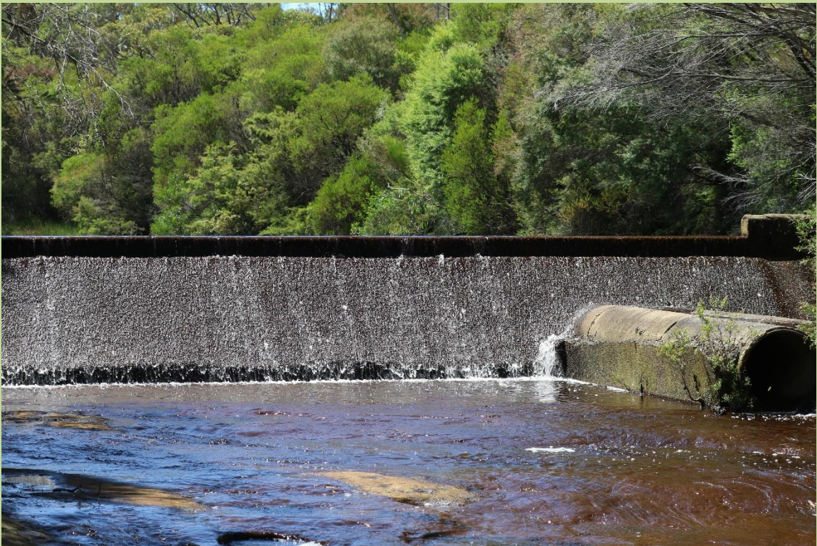
The check dam used by the orchard under licence from NPWS