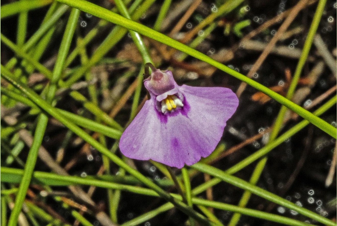
Utricularia dichotoma – Fairies Aprons (Bladderwort)