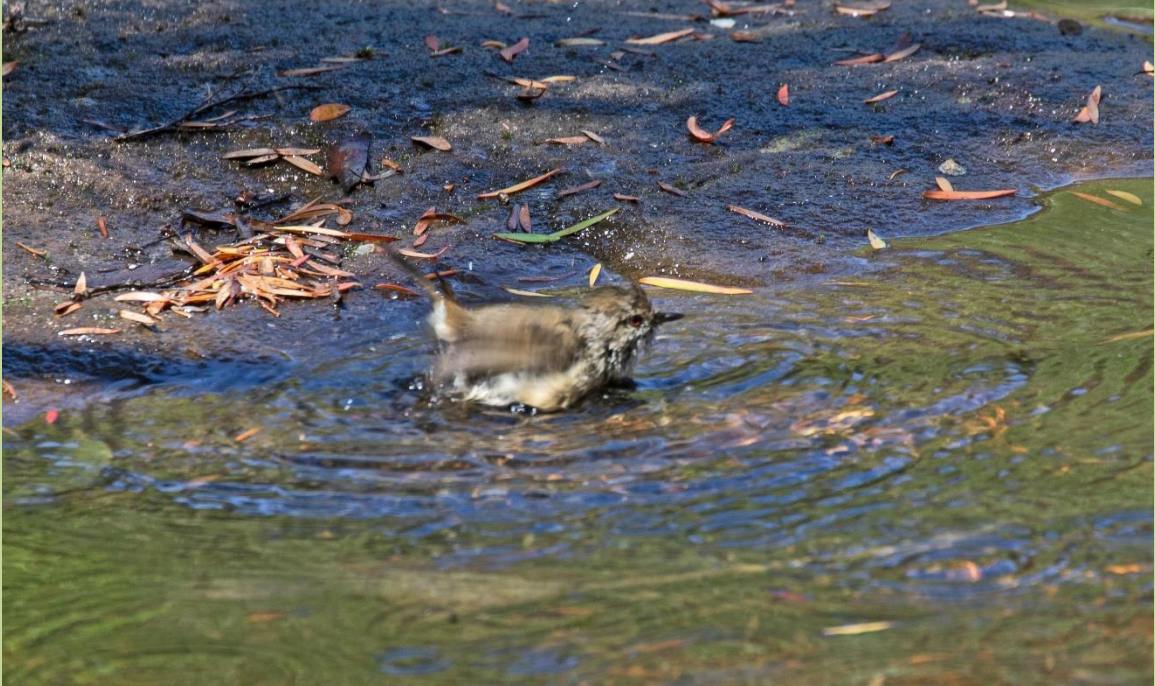
Bath time – a distant shot but possibly a very juvenile White-browed Scrubwren