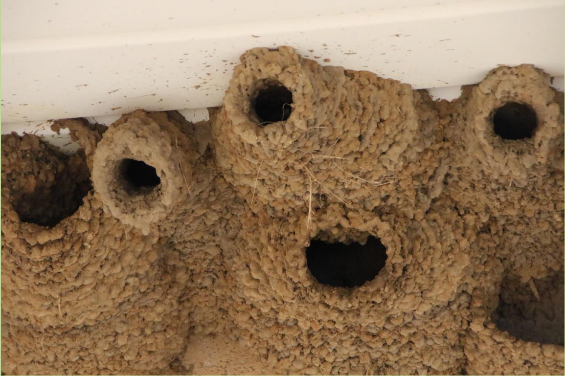
Fairy Martin nests