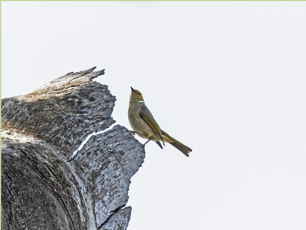
Grey Shrike-thrush (above) and White-plumed Honeyeater (below)