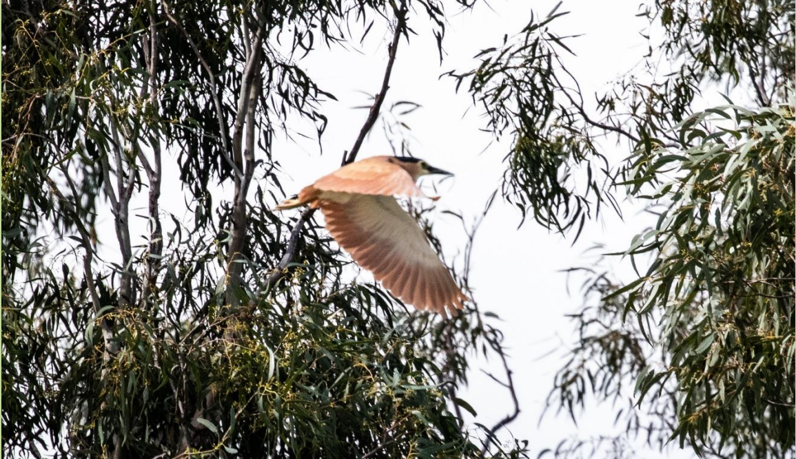
Nankeen Night Heron