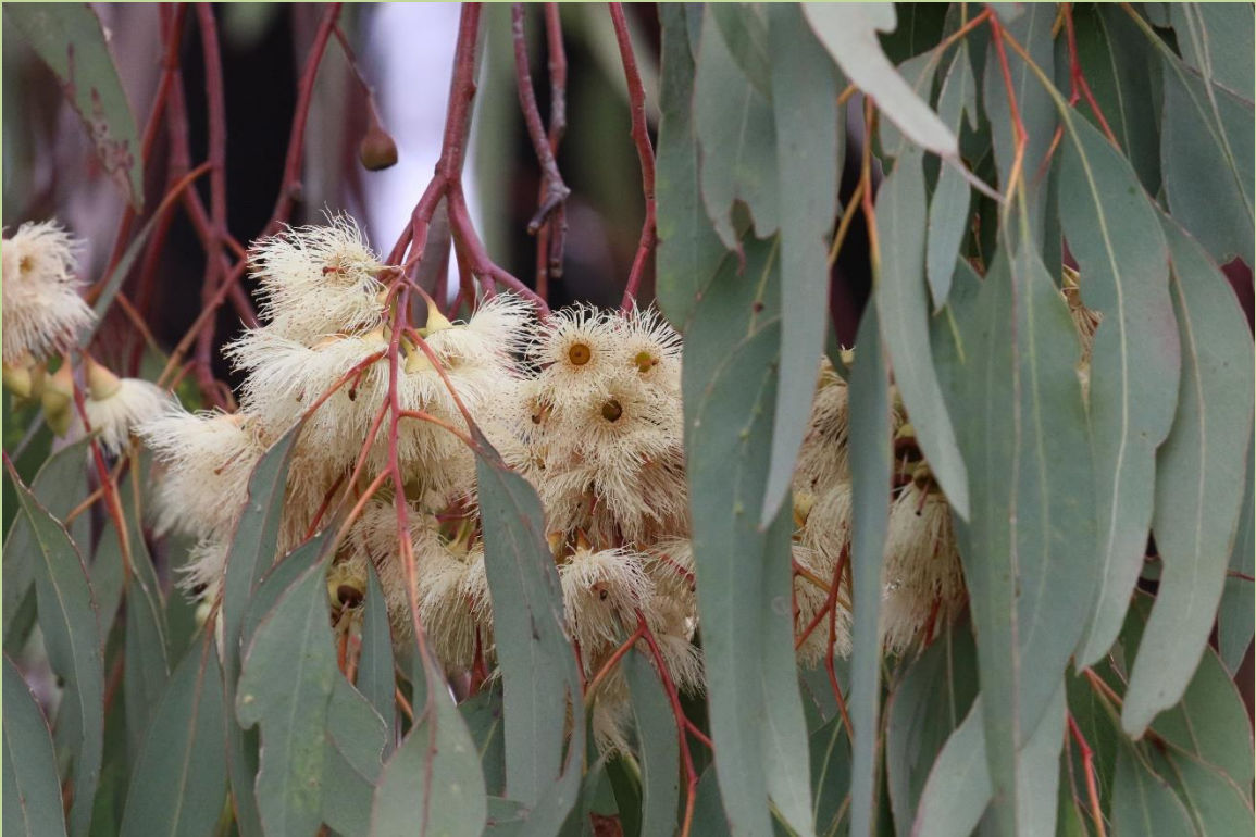
Ironbark – Eucalyptus sideroxylon