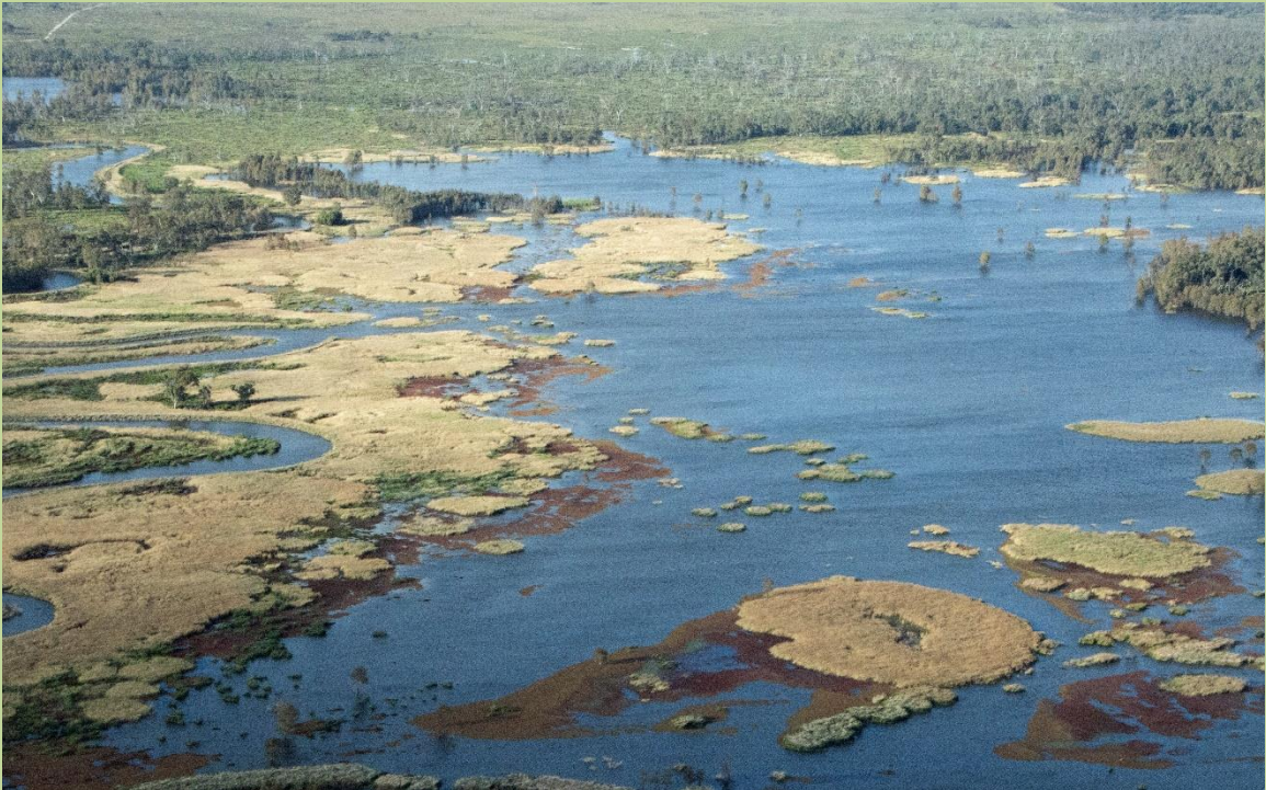
The reed beds of the Great Cumbung Swamp