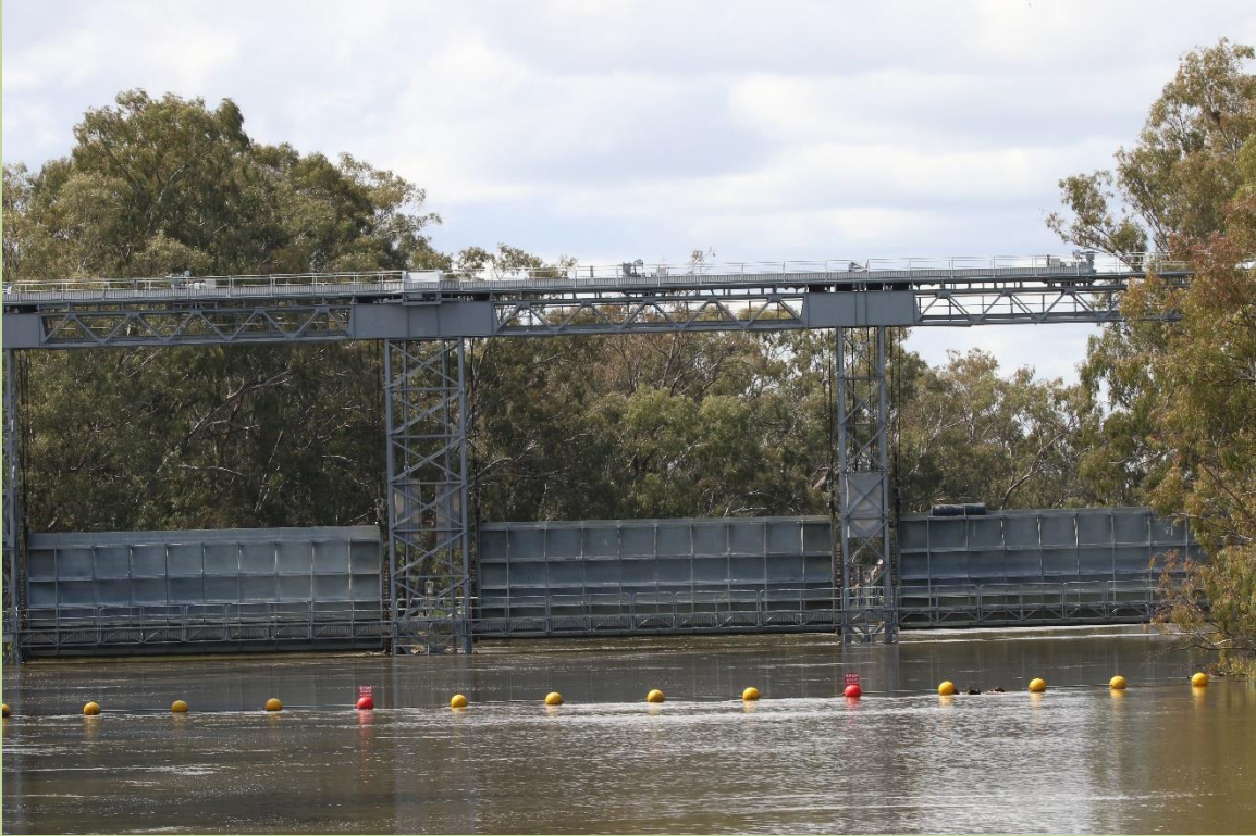
The gates are all open