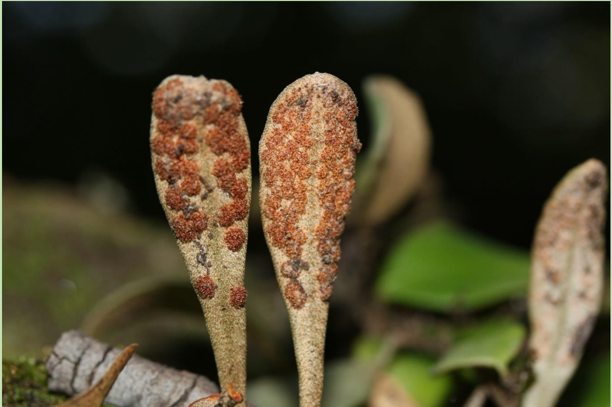
Spores of the Rock Felt Fern, Pyrrhosia rupestris