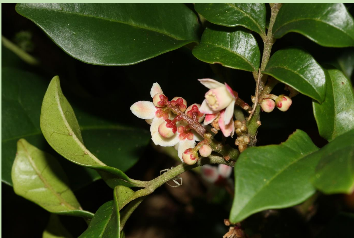
Synoum glandulosum - Bastard Rosewood or Scentless Rosewood