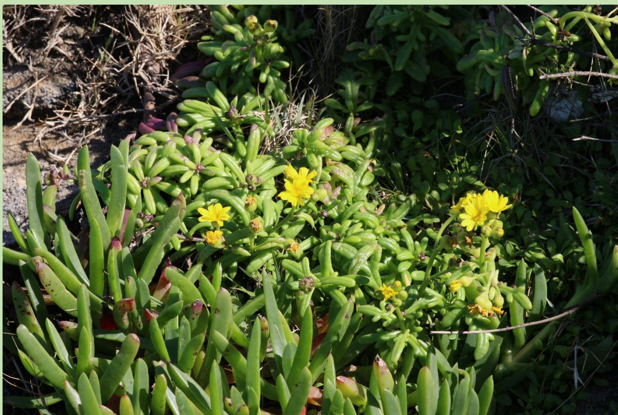
Senecio laetus subsp. maritimus – Coast Groundsel