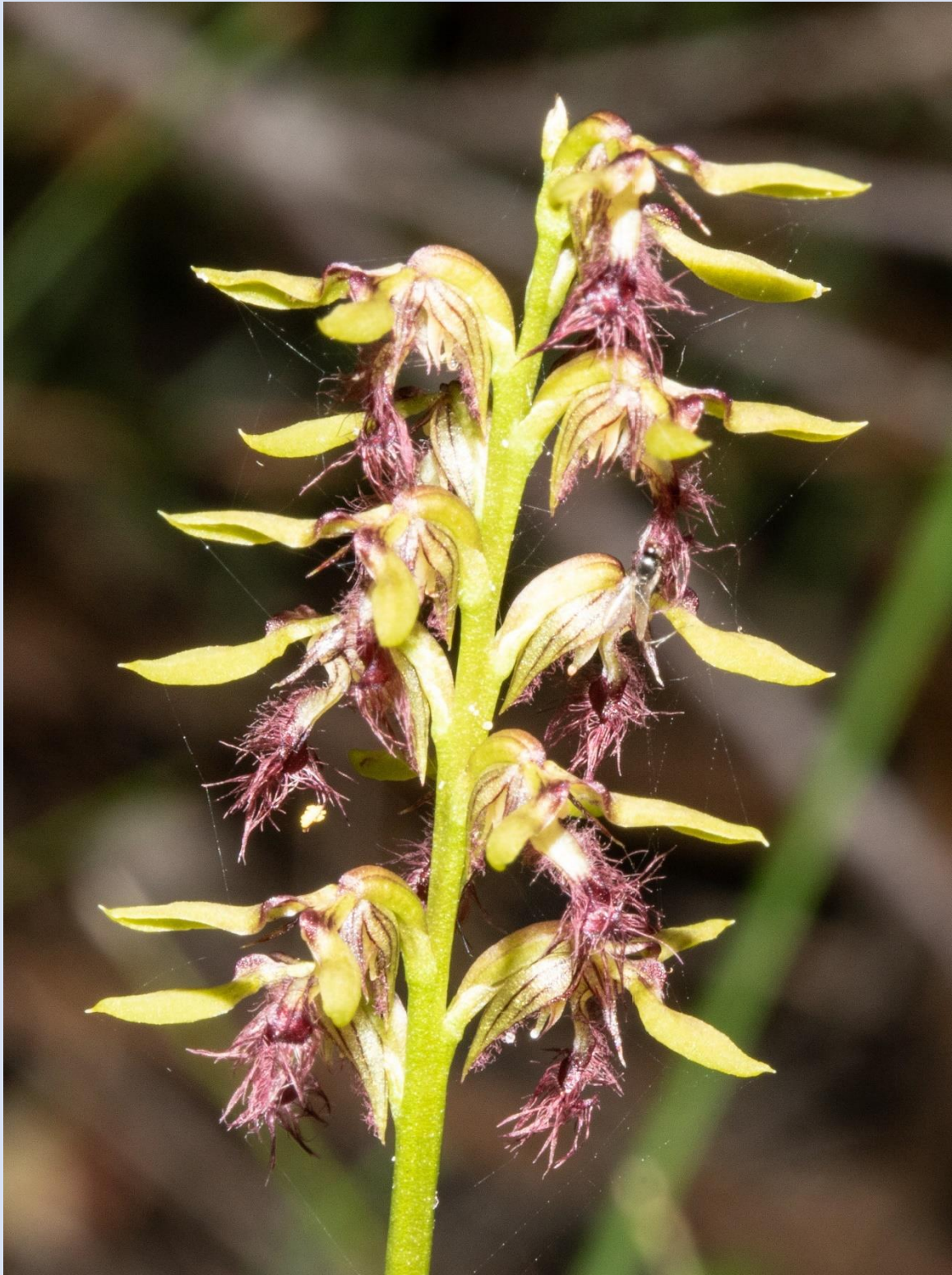
And the find of the day, a Corunastylis fimbriata

That just left me with one more stop. We checked out a location behind one of the ranger residences in Audley and there were still some Corunastylis filiformis in flower!!!! I should explain that these flowers are very, very tiny! They are also called Midge Orchids!