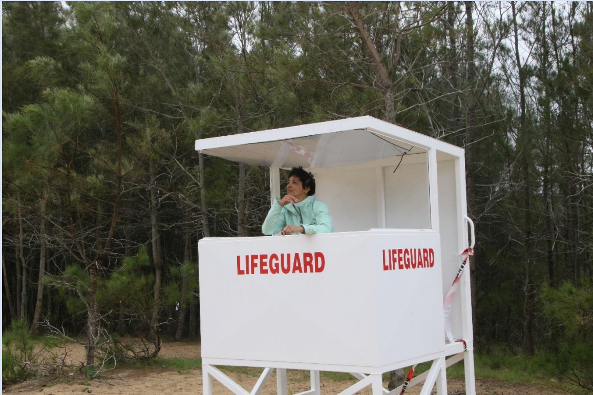
The new life guard