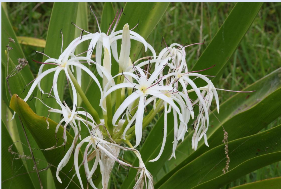
Crinum pedunculatum – Swamp Lily