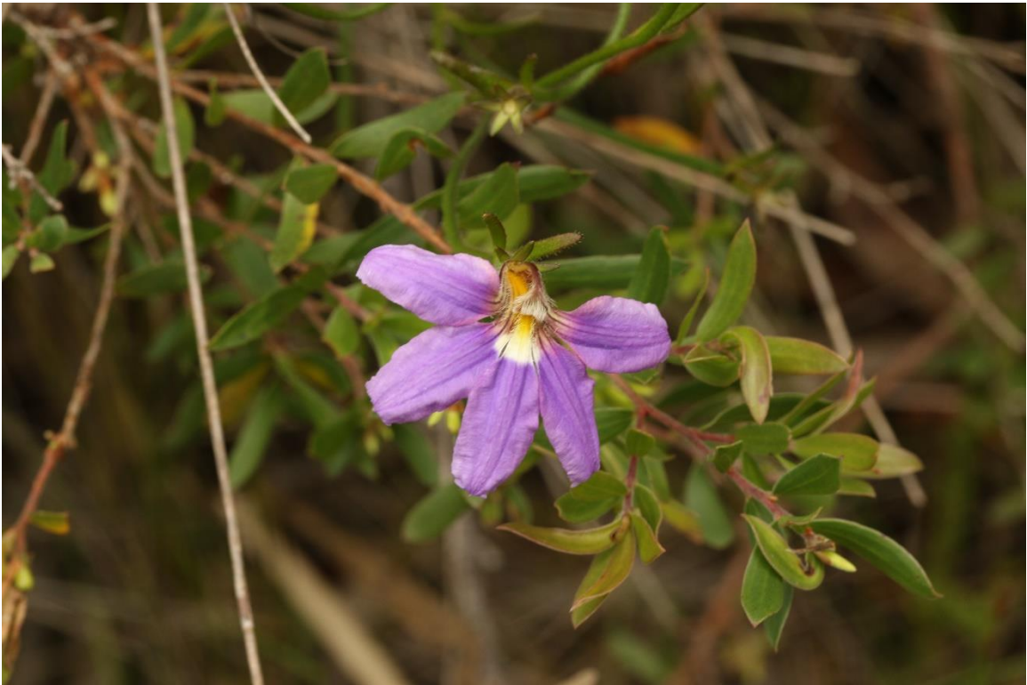
Lots of Scaevola ramosissima