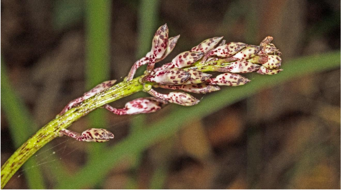
Dipodium striatum in bud