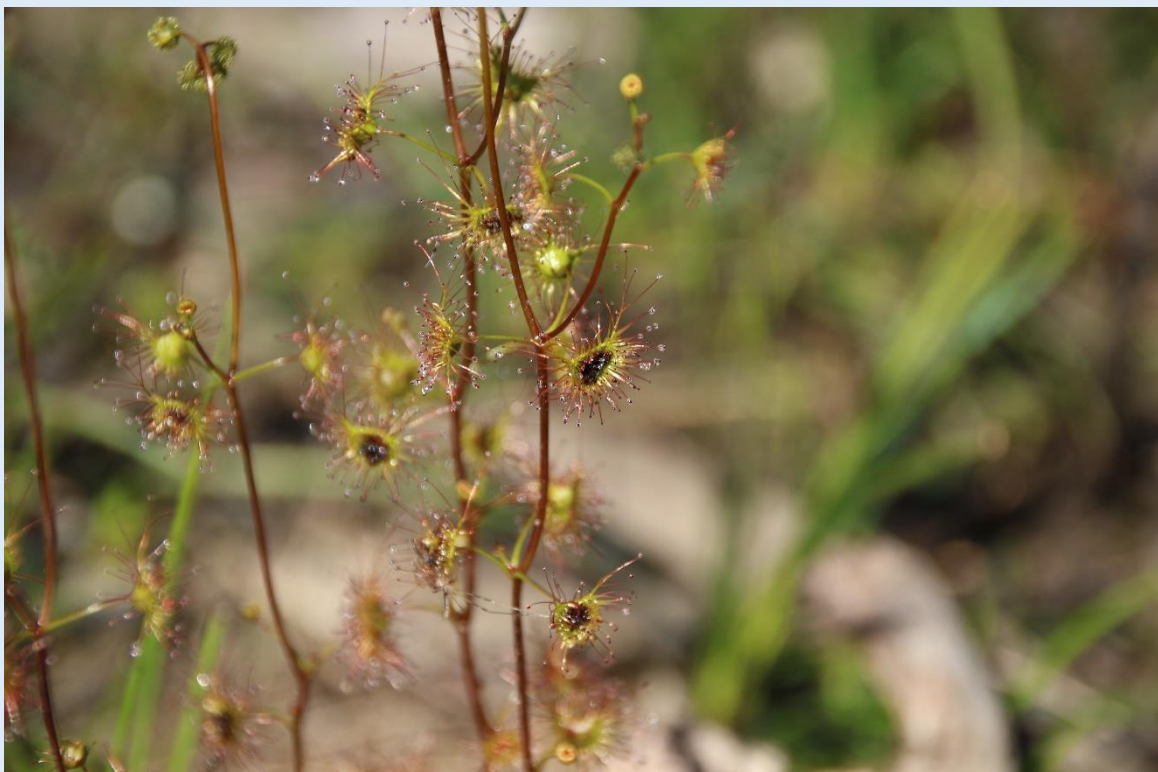
Two species of Drosera