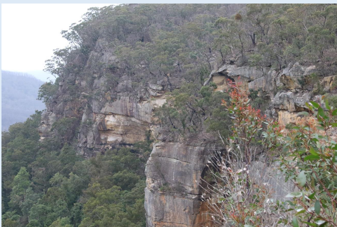
It was quite misty