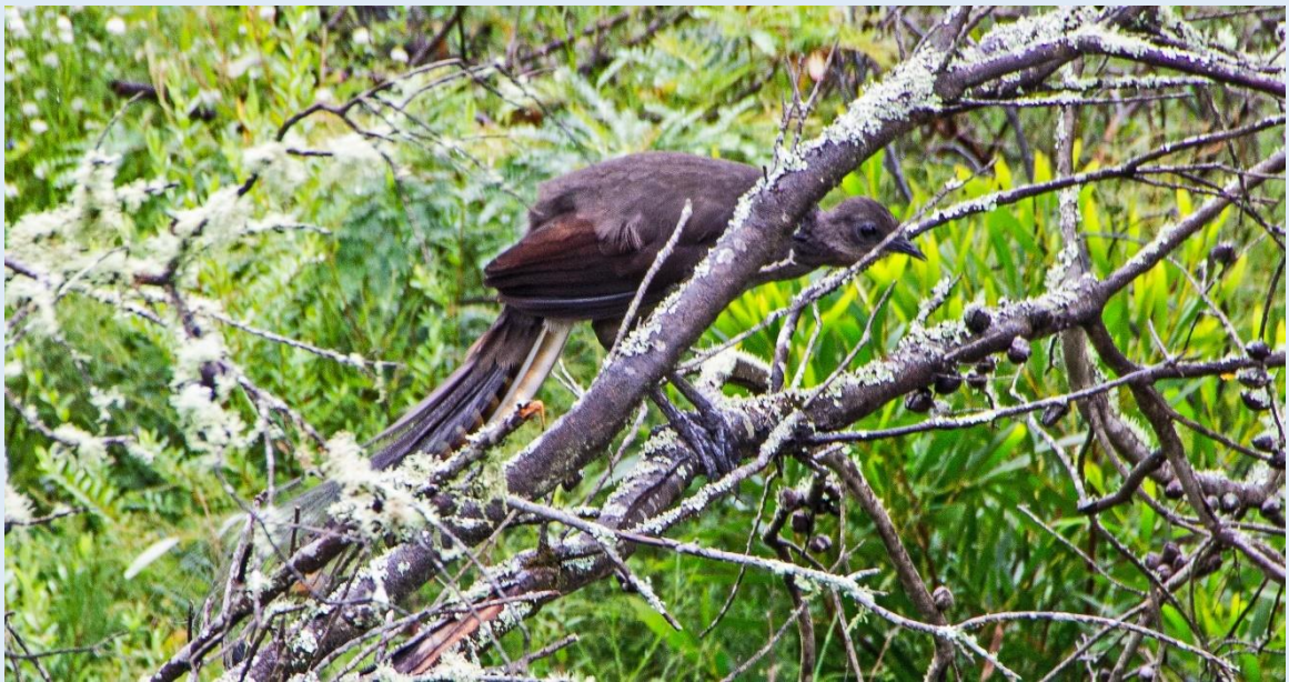
Singing in the rain