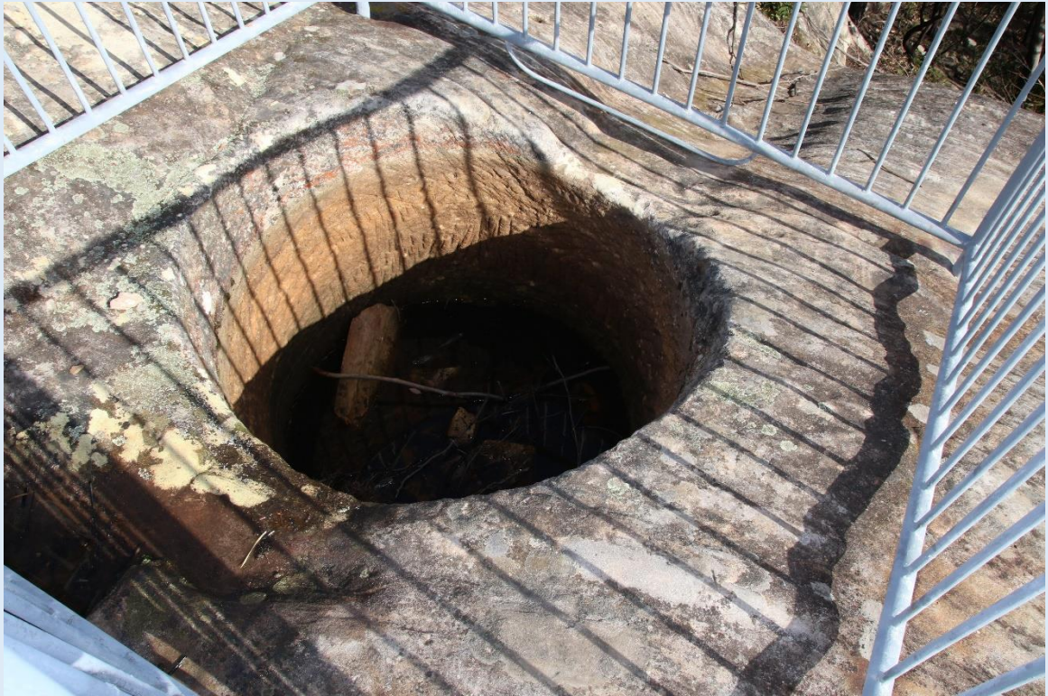
The Wishing Well