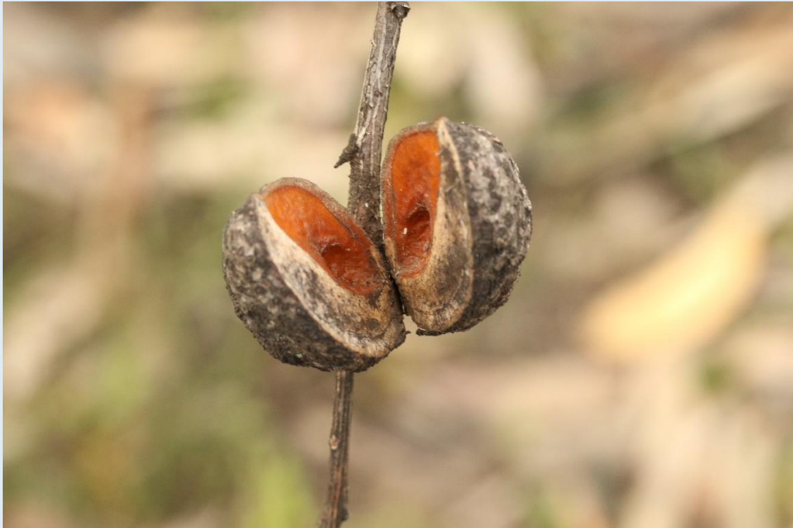
The hakea has shed its seed