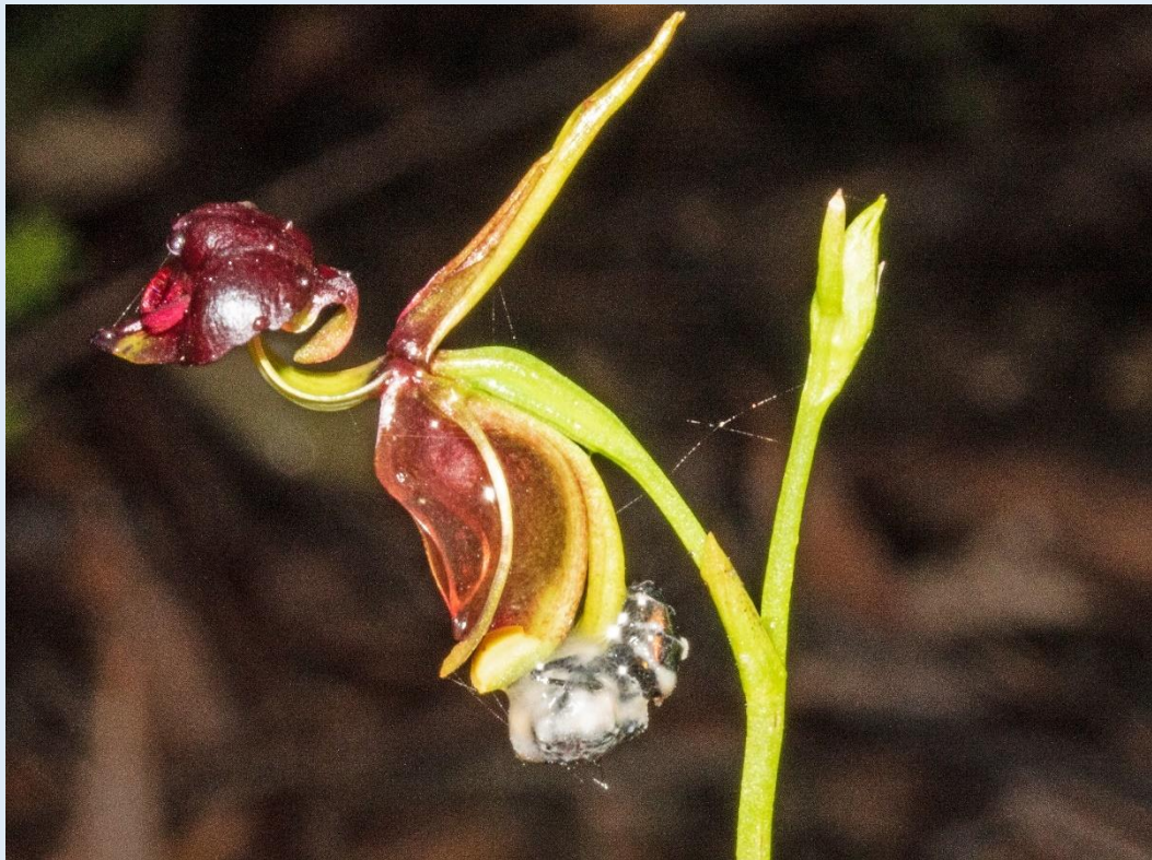
The ducks are still out! Caleana major