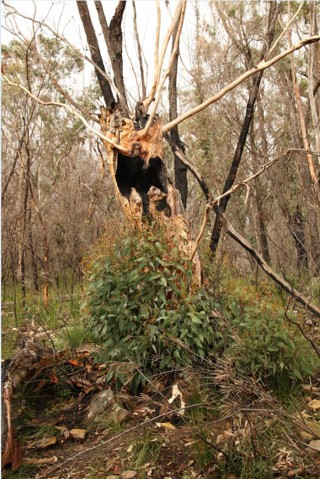
Amazing growth from the base of a burnt out tree