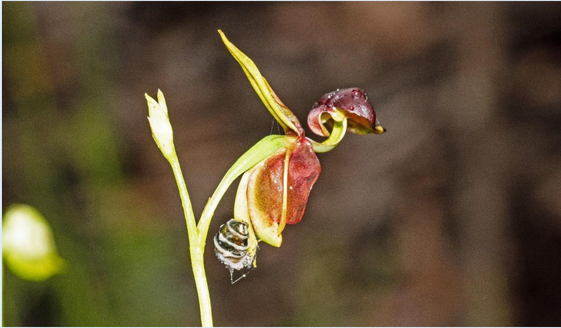
Not sure about the bee!