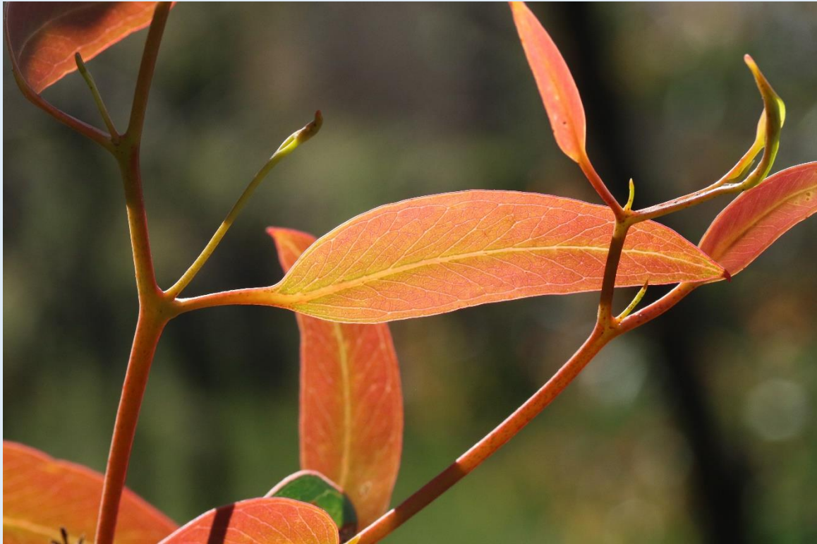
An example of anthocyanin in newly emergent leaves. It may provide protection against insect attack and/or sun damage