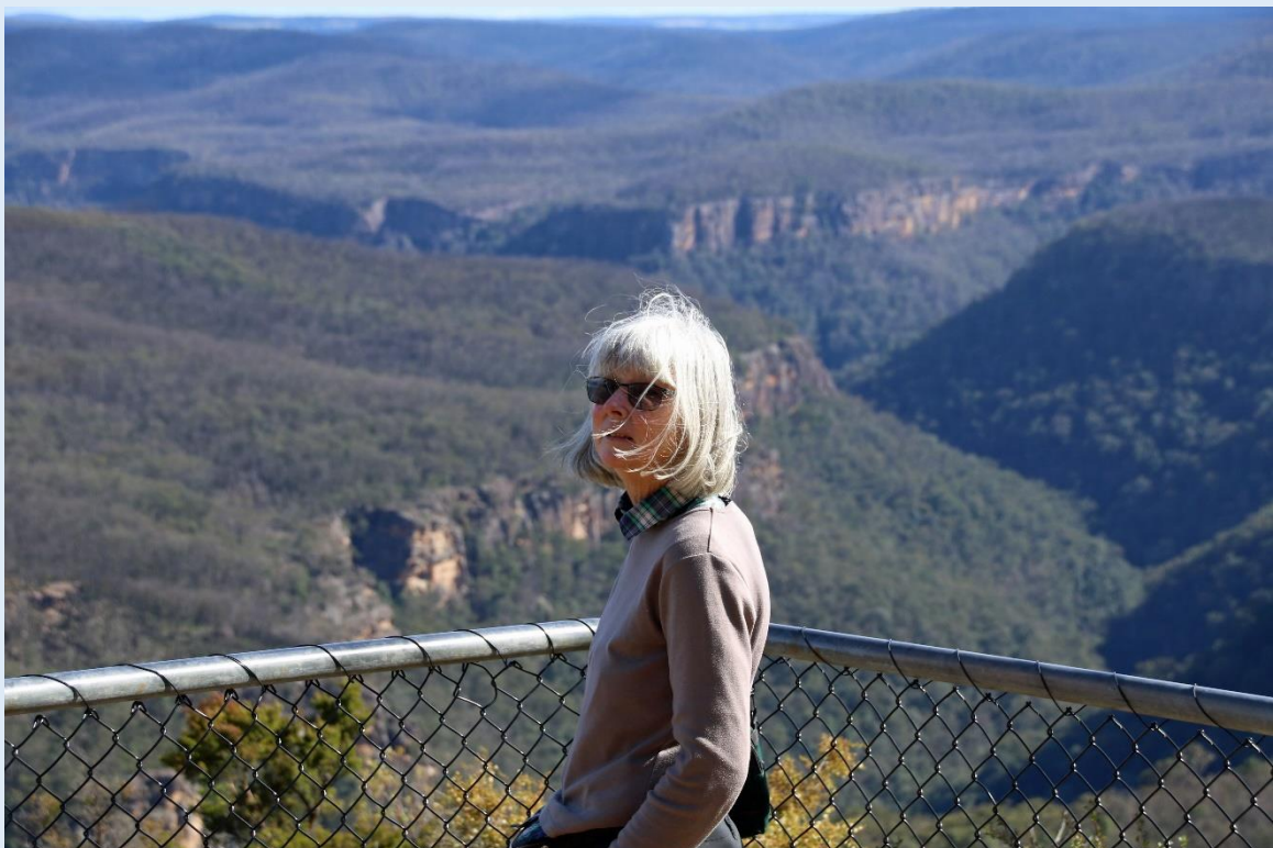
What a Bonnie View