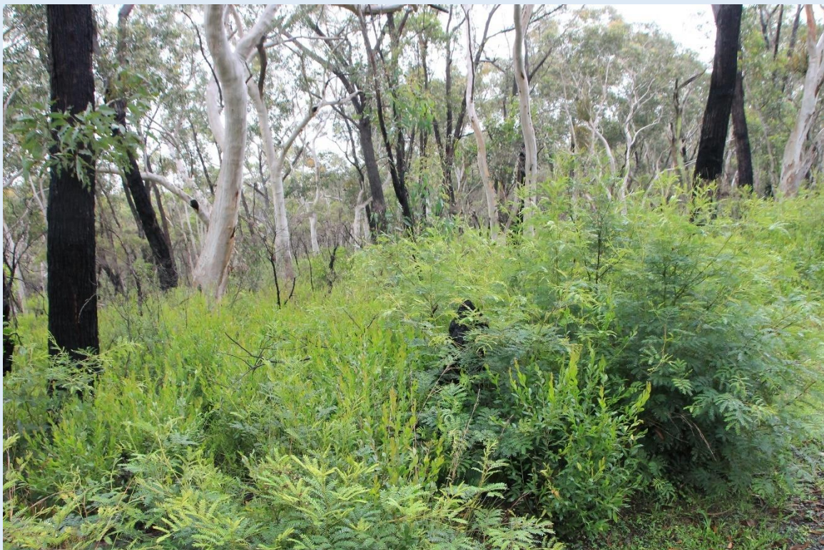
The understorey is thick with growth