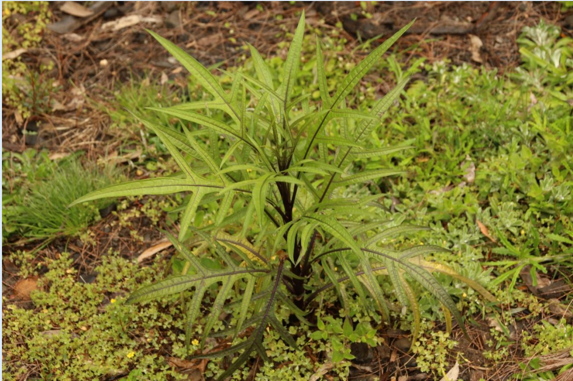
Solanum aviculare 1