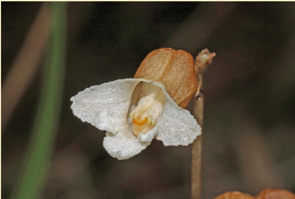
Gastrodia sesamoides – Cinnamon Bells or Potato Orchid