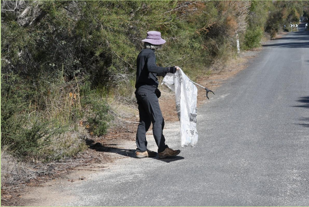
Collecting roadside rubbish

After that walk Faye and I went down to Warumbul once more and took out another three large bags of Mother-of-Millions! There is more work to do!