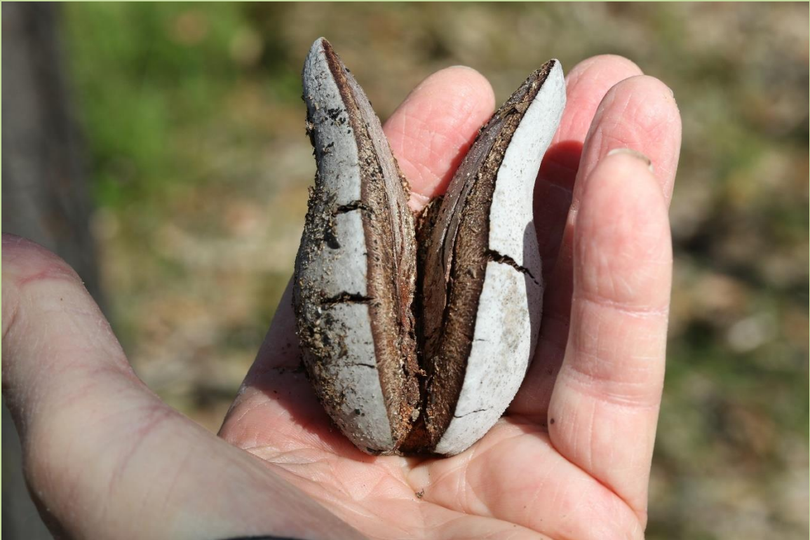
Seed capsule for a Woody Pear – Xylomelum pyriforme