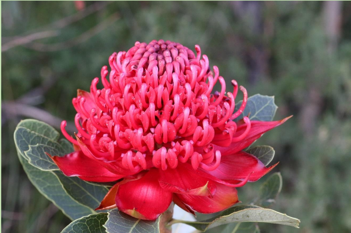
Telopea speciosissima – at least no-one is coming down here to cut them