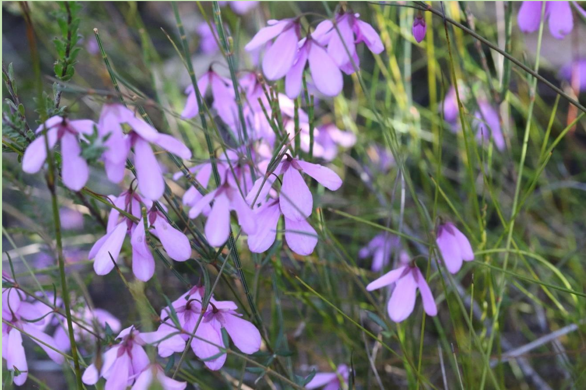
The Tetratheca have been magnificent this year