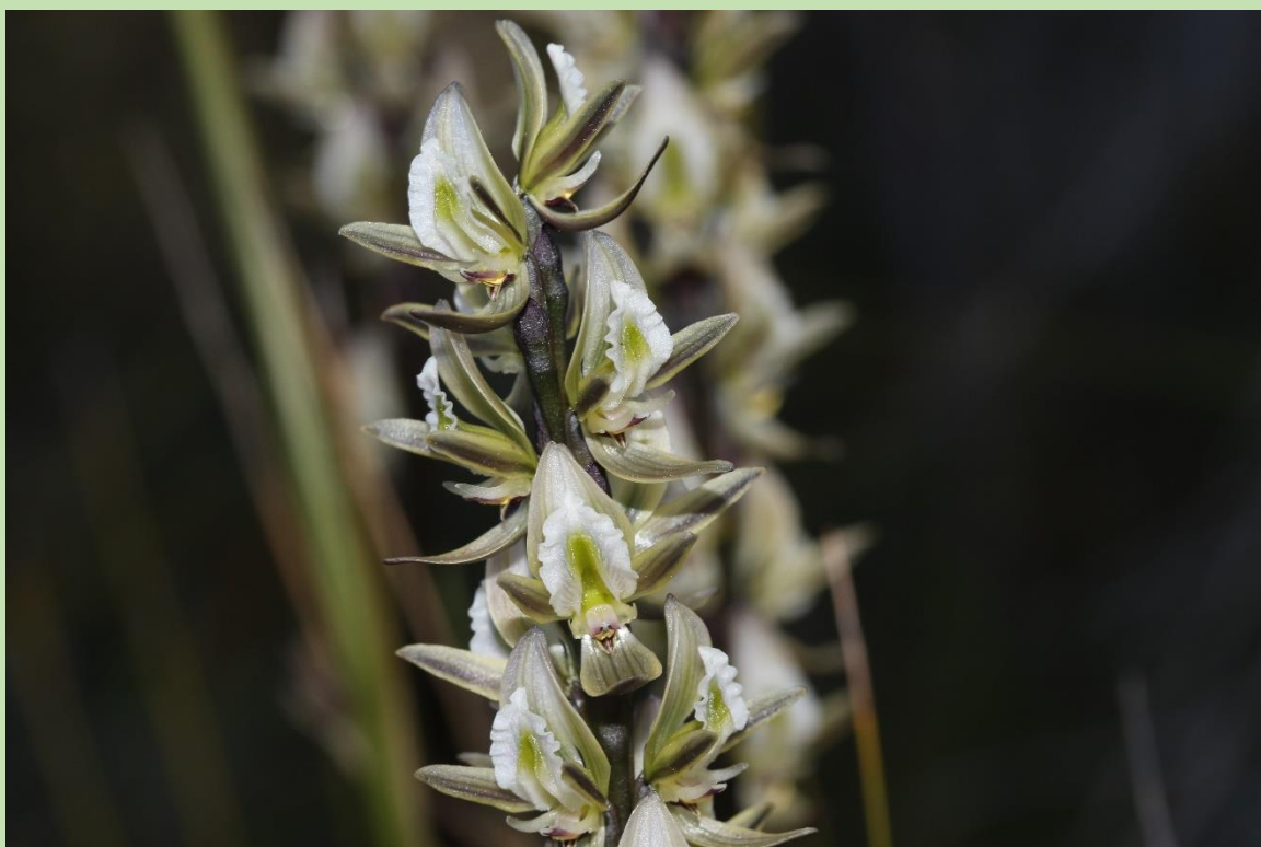
Prasophyllum elatum – Tall Leek Orchid