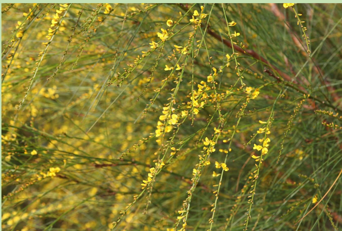
Viminaria juncea - Native Broom