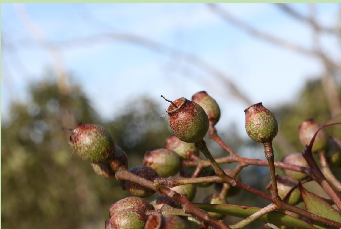
Bloodwood seed capsules