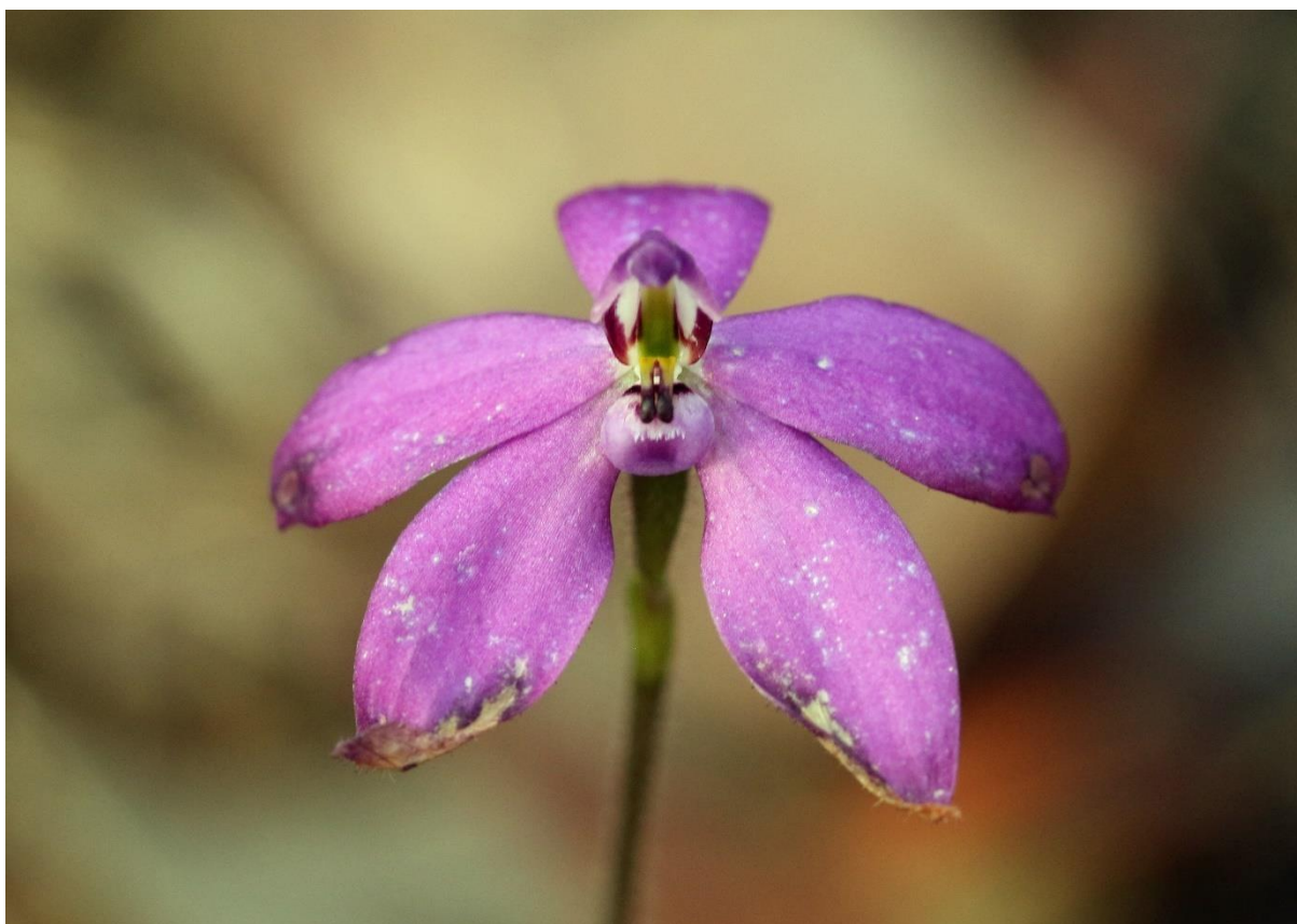
Glossodia minor , a little tacky