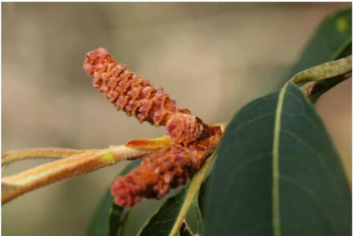
It will soon be in bloom