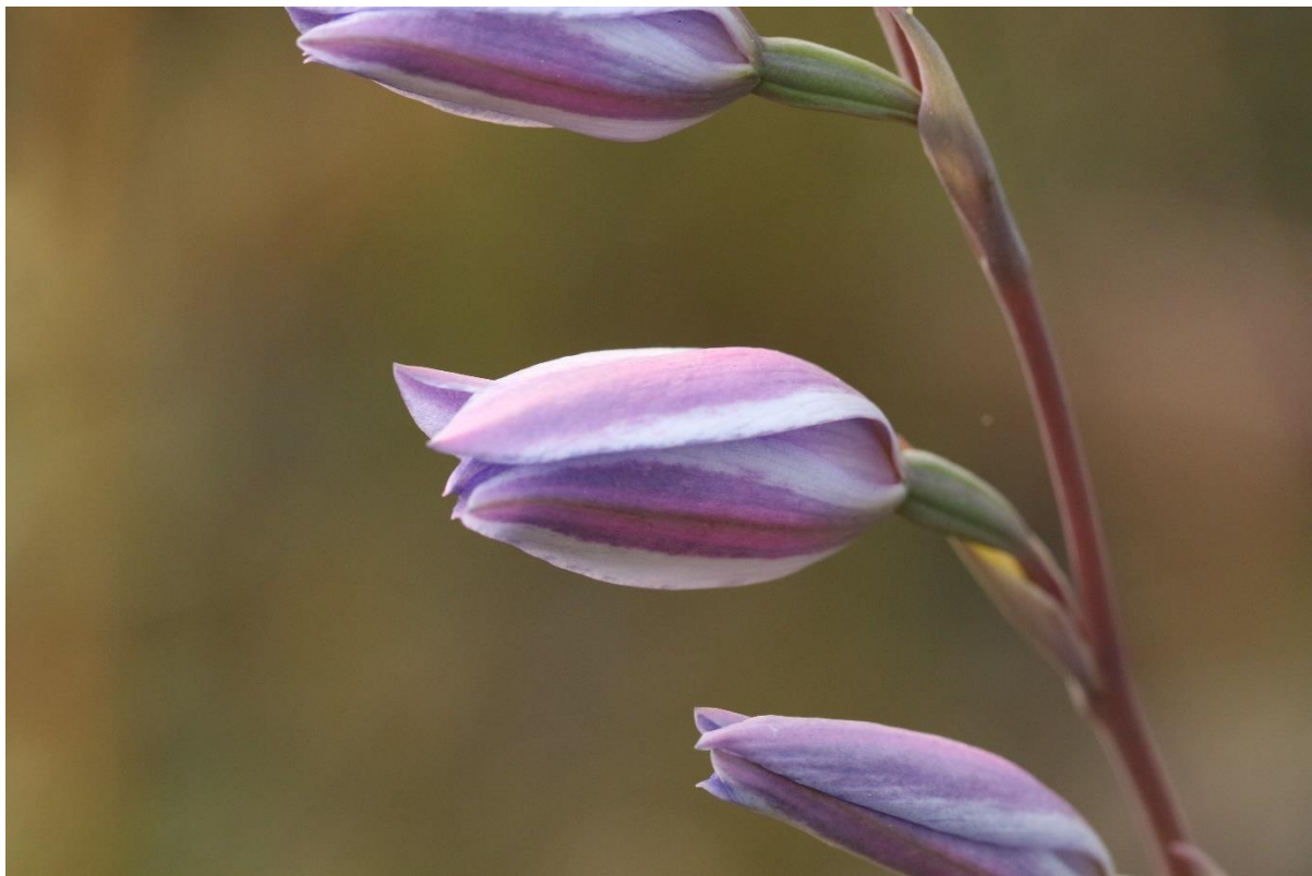
Thelymitra ixioides , in bud