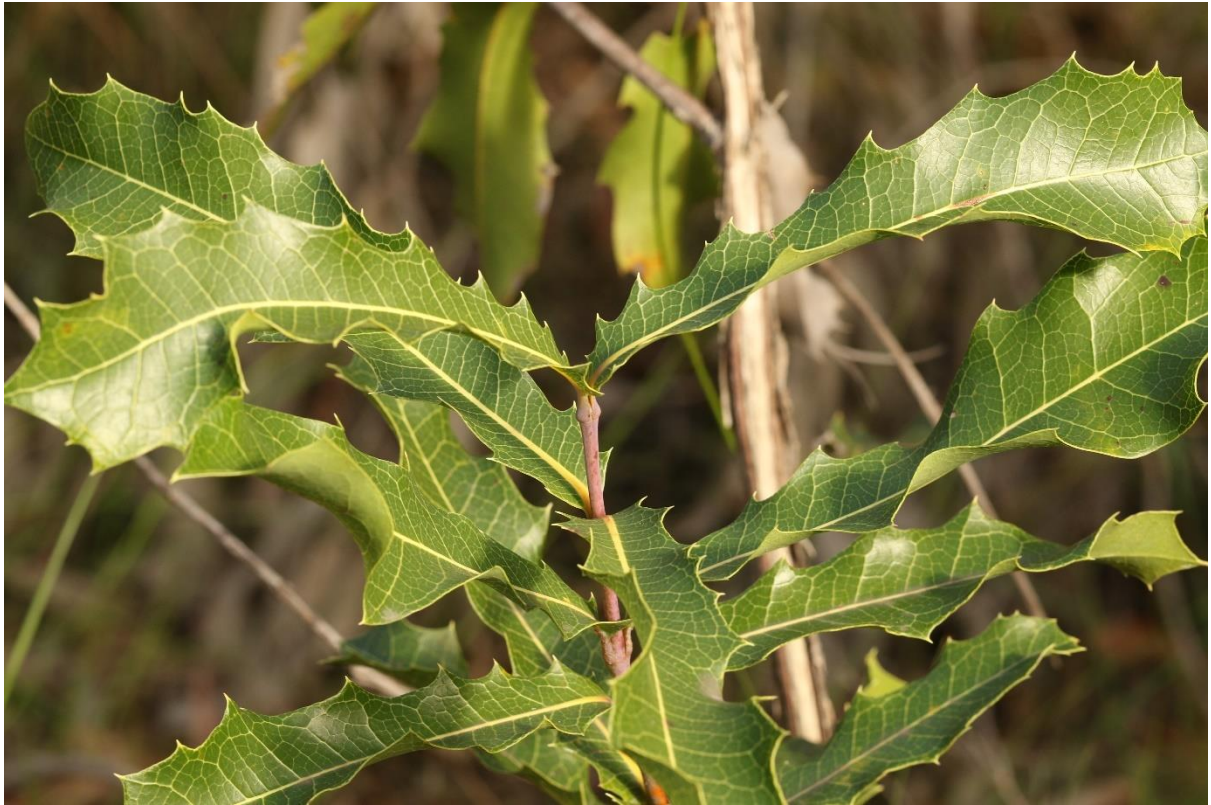
Xylomelum pyriforme - Woody Pear