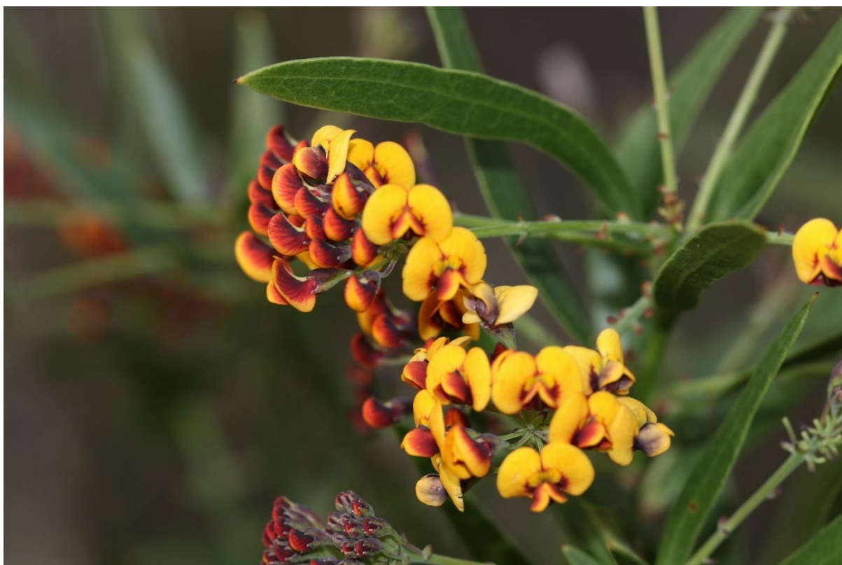
Daviesia corymbosa , methinks