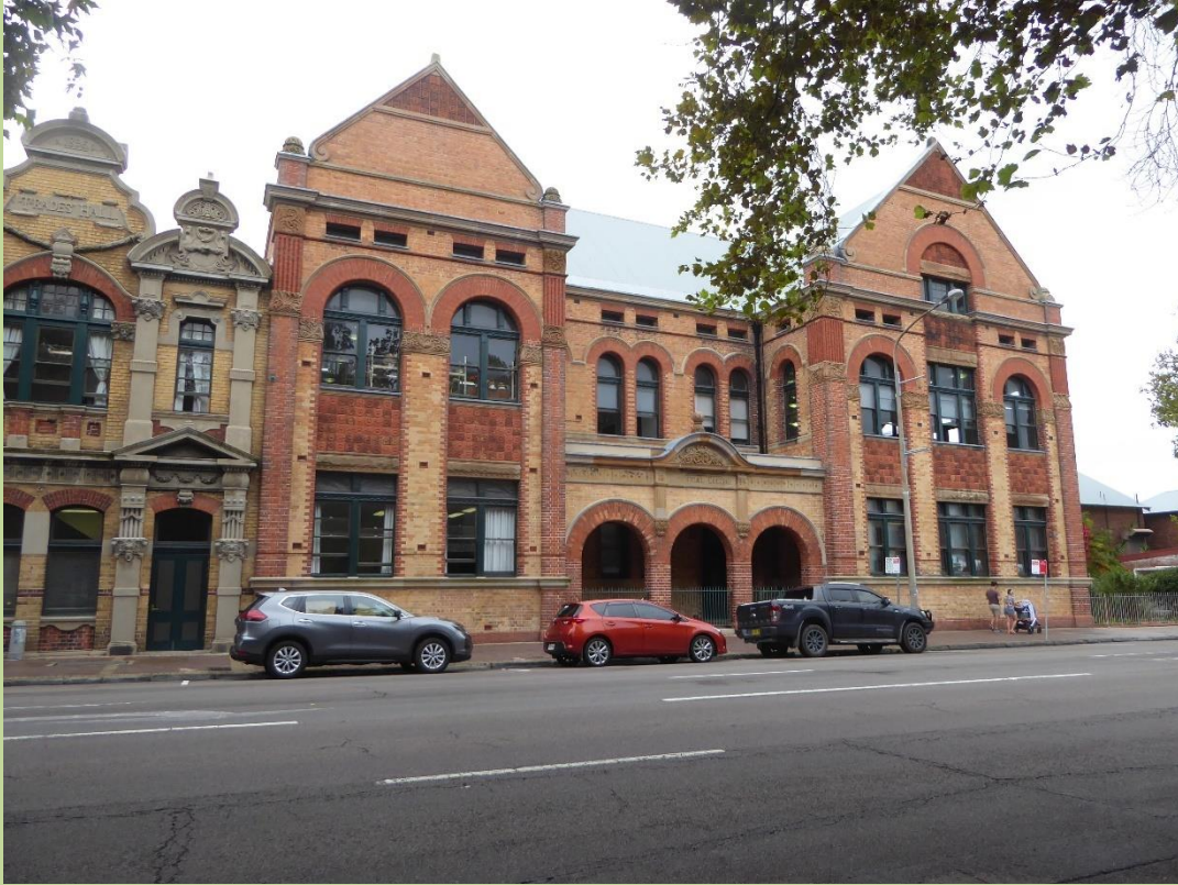
The old Technical College – now an art college