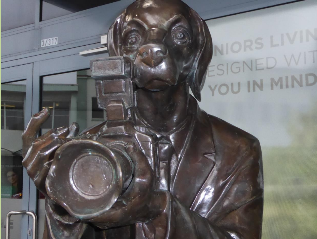
Paparazzi Dogman and Rabbitwoman