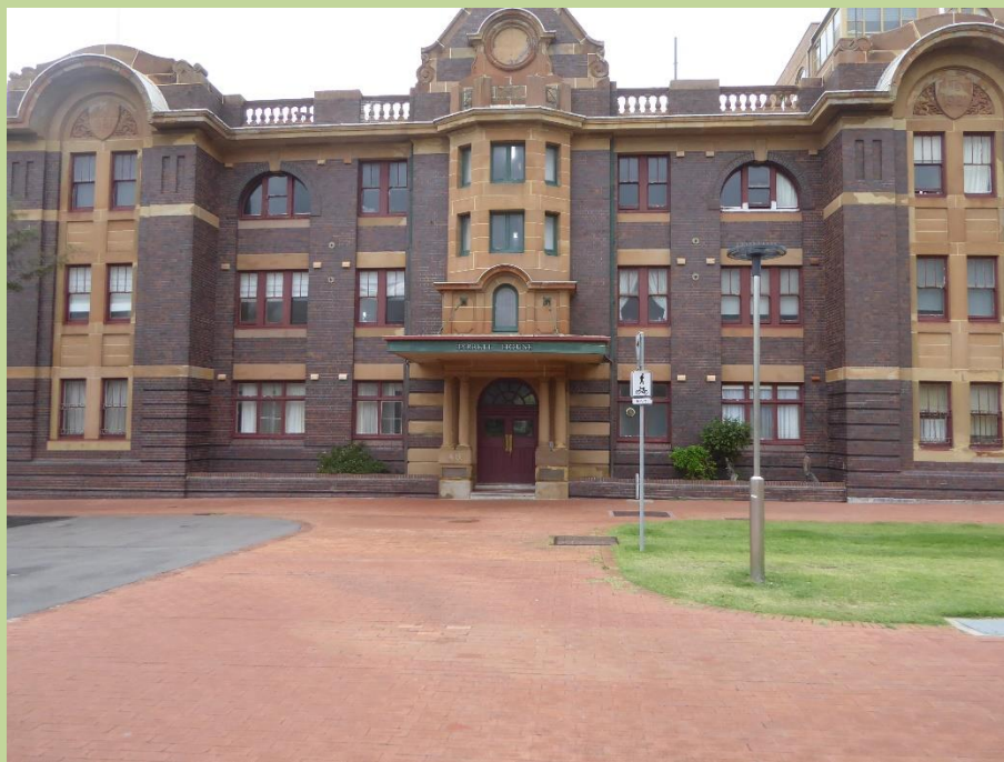
Tyrrell House 5