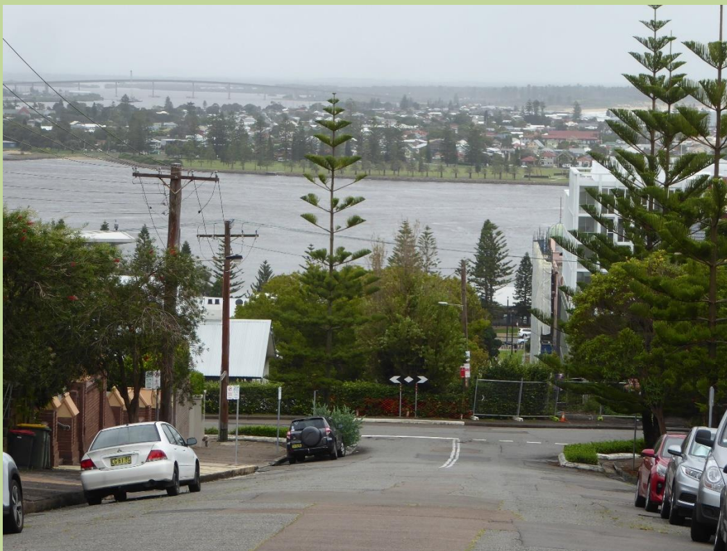
That's Stockton over the Hunter