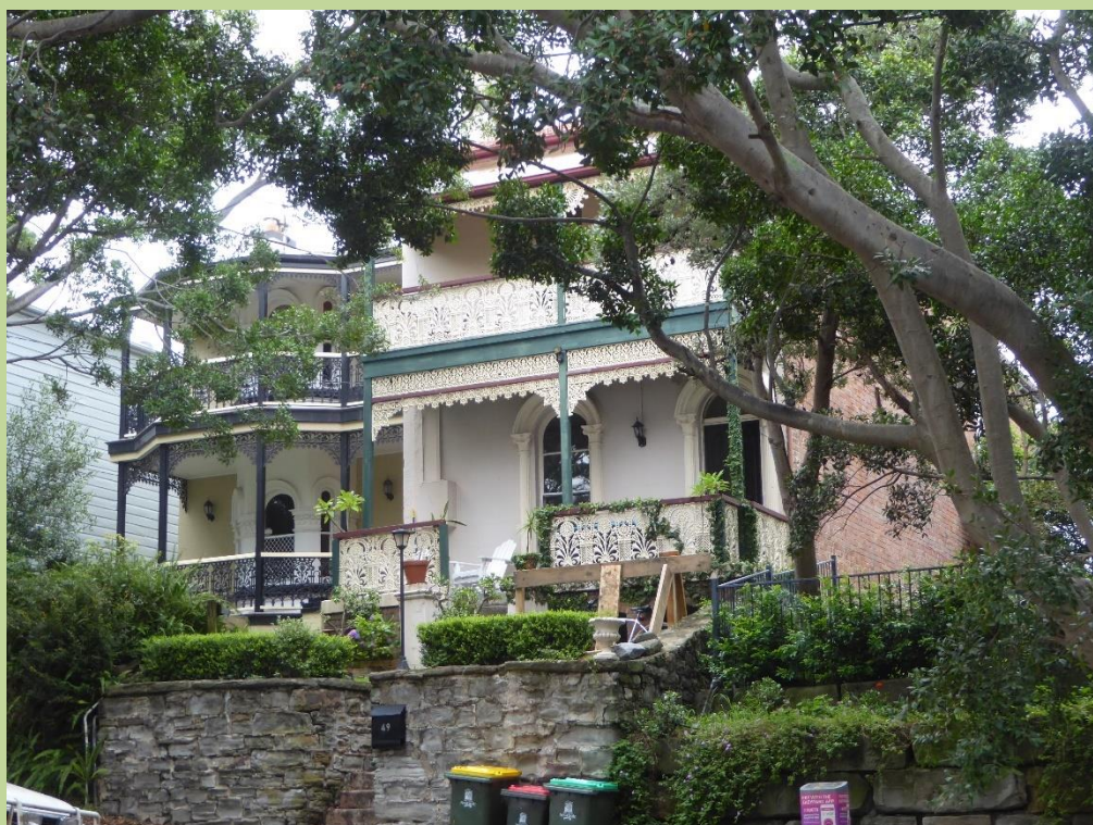
Homes on The Hill: we attended parties here with people such as Milorad Pavlovic and Greg Giles. Some of these old homes had 14-foot ceilings