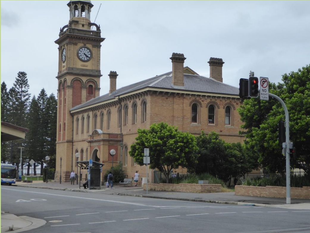
Newcastle Customs House