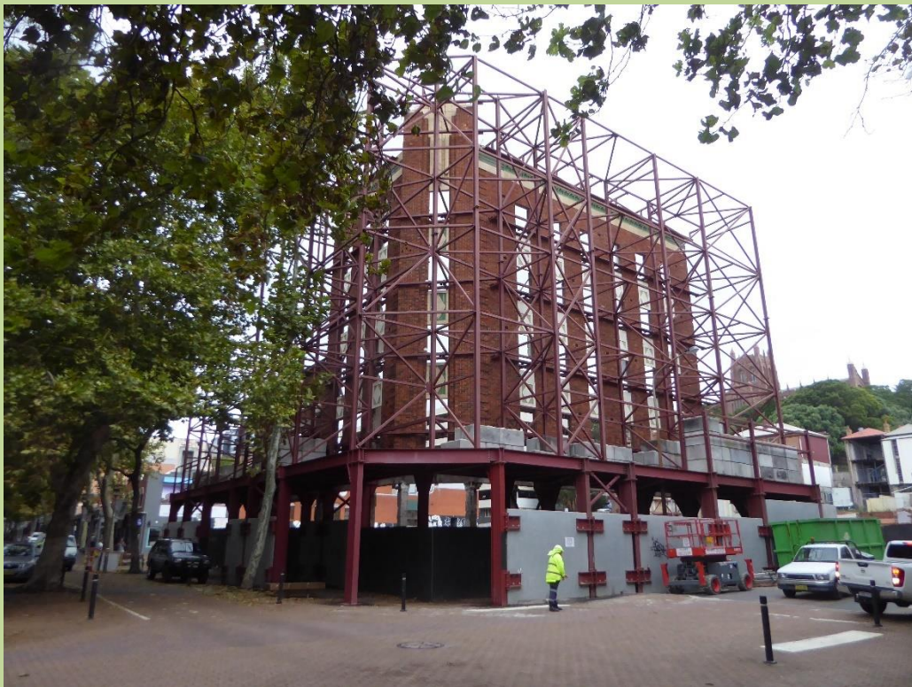
The facades being “preserved” while behind it something else