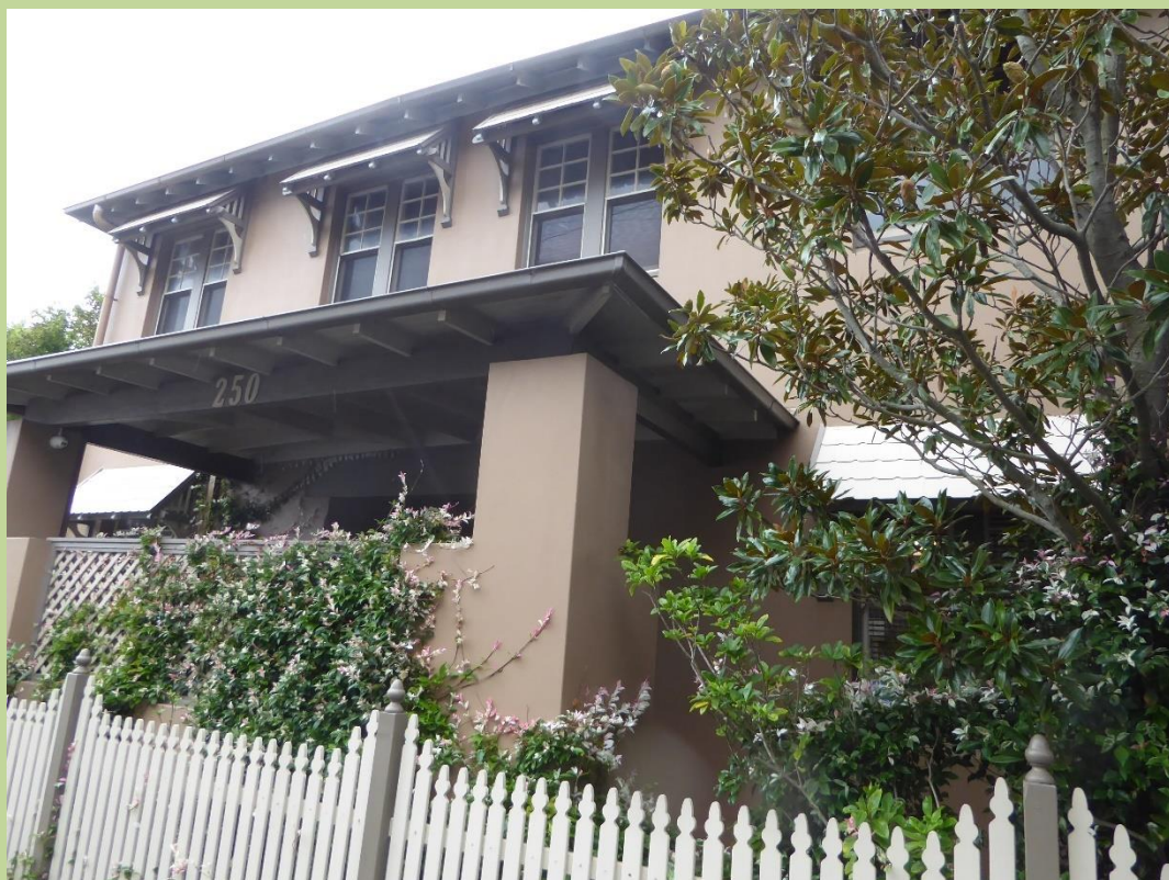
The hostel where Faye stayed