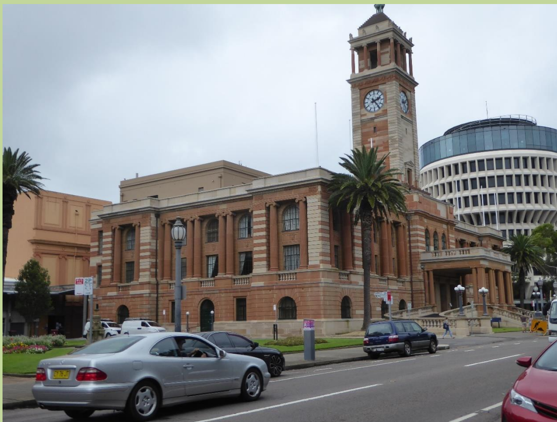
Newcastle Town Hall: in 1974 we booed Billy Snedden here