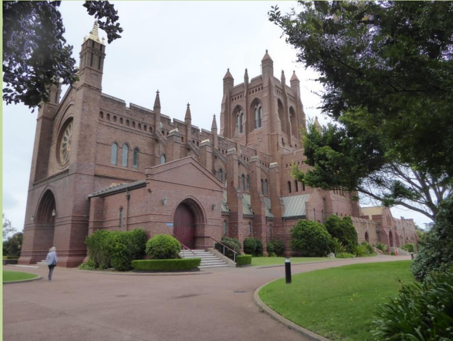
Christ Cathedral – badly damaged in the 1989 earthquake but basically rebuilt Faye helped make banners for a production of “Murder in the Cathedral” that happened here in 1973