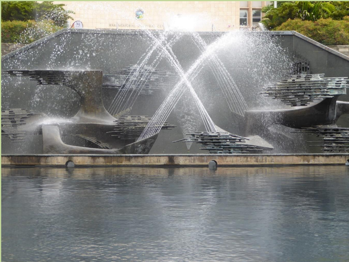
The fountain designed by Margel Hinder 2

Hinder's acknowledged master work is the water sculpture known as the Captain James Cook Memorial Fountain located in Newcastle, New South Wales's Civic Park. Completed in 1966, it was created with steel, copper and granite.