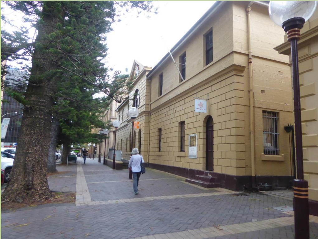
The old police station and lock-up