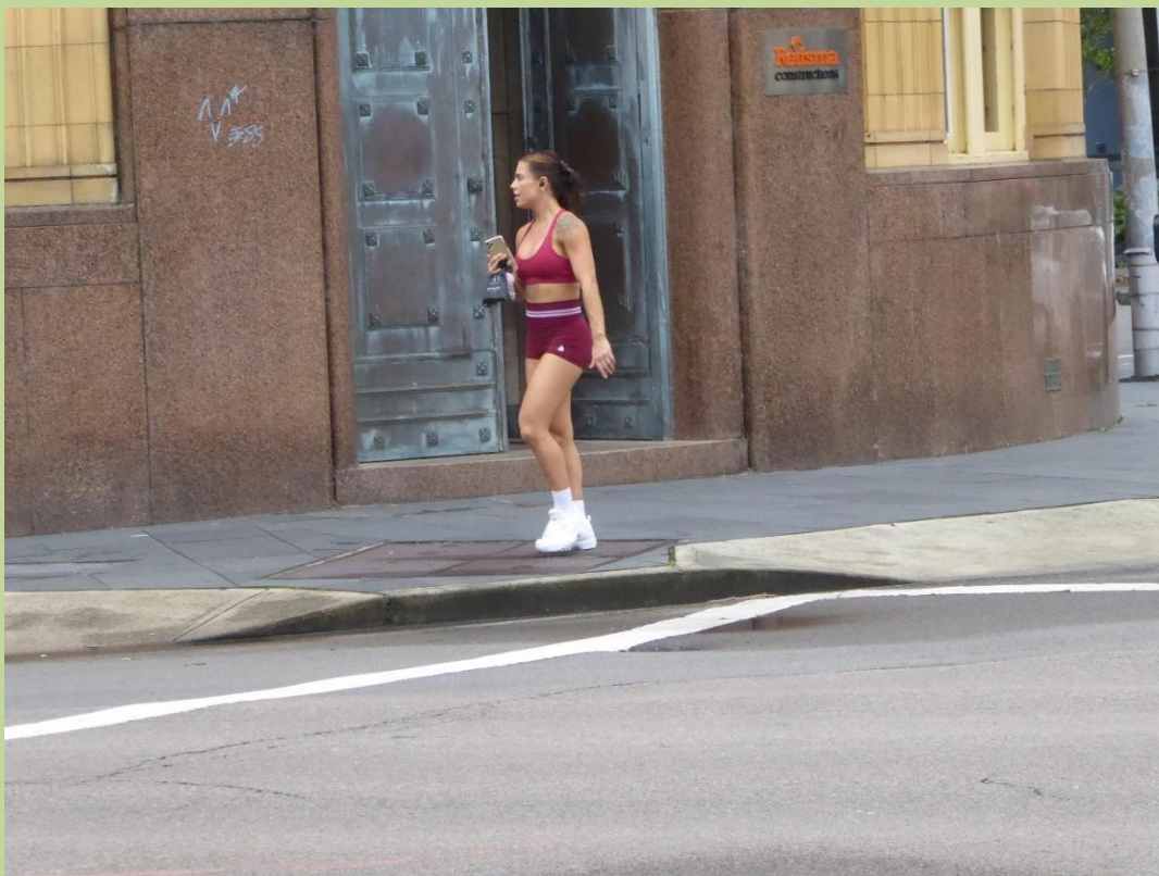
The new urbanite!