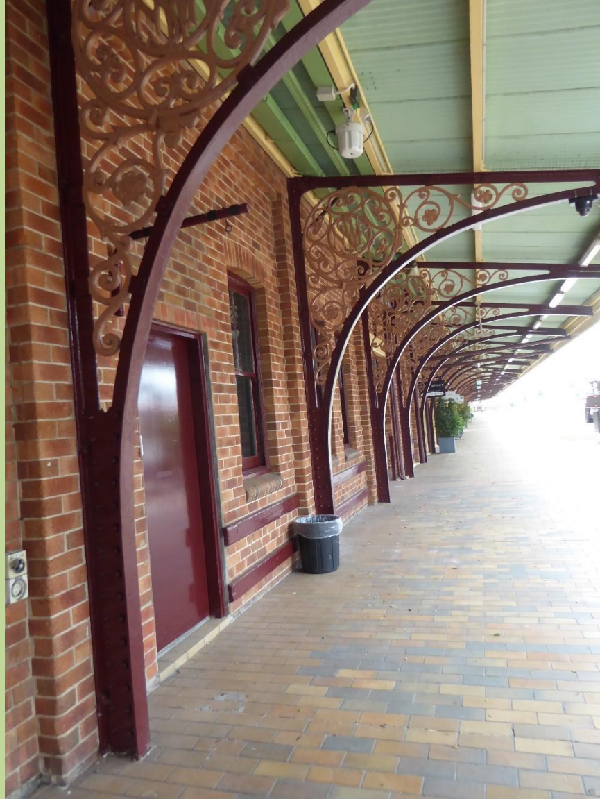
Replaced with a light rail line!