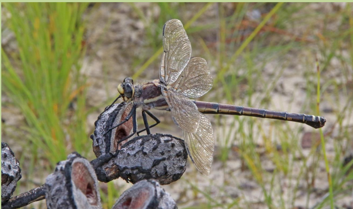
Giant Dragonfly ( Petalura gigantea )

With the added desire to see a Giant Dragonfly 2