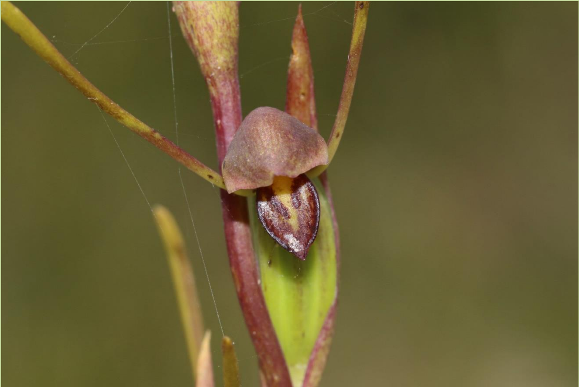
Orthoceras strictum – Horned Orchid