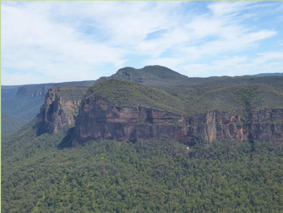
The sandstone plateau with the rounded Mount Banks, olivine basalt cap, in the distance

Finally we climbed Mount Hay and in that last part of the climb we emerged out of sandstone and into soils derived from olivine basalt 3 . The vegetation changed immediately.