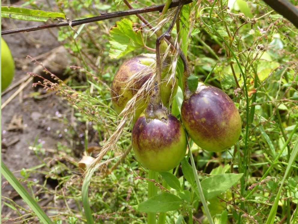
Solanum sp in the basalt soils