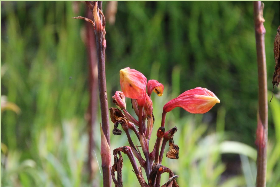
Blandfordia cunninghamii – Mountain Christmas Bell