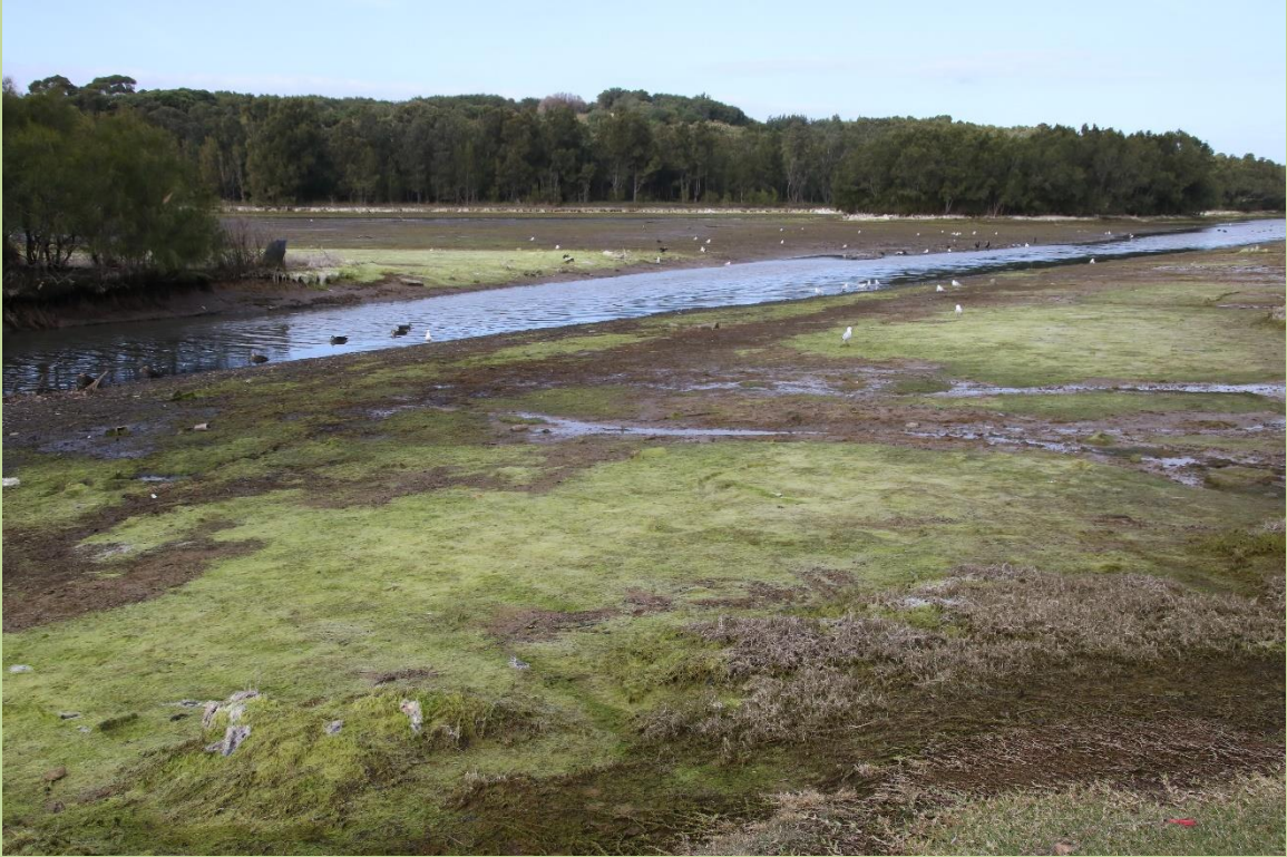
Bellambi Lagoon – it was amazing to see the birdlife here!